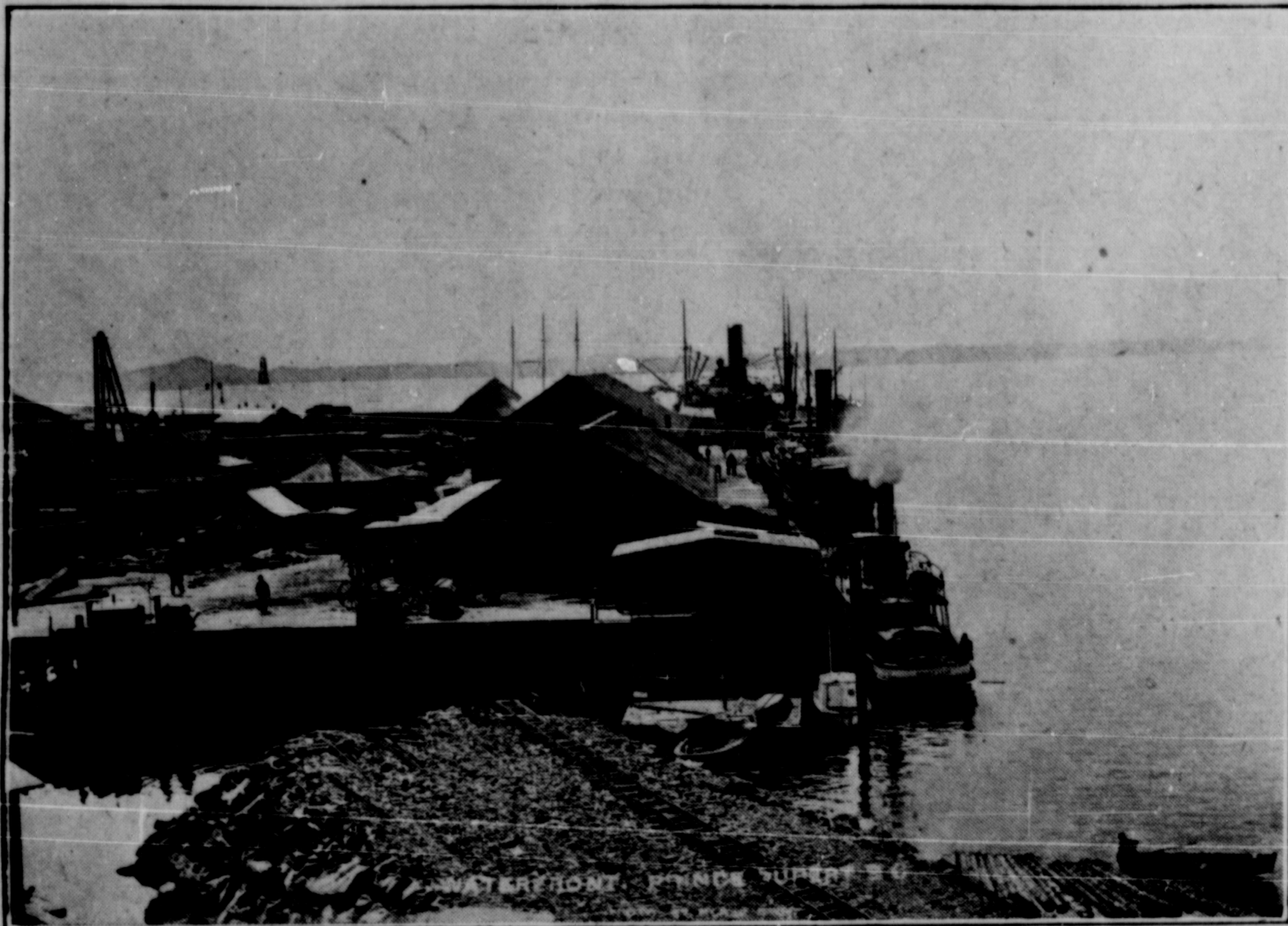
What the G.T.P. Wharf looked like just before the Premier was here last