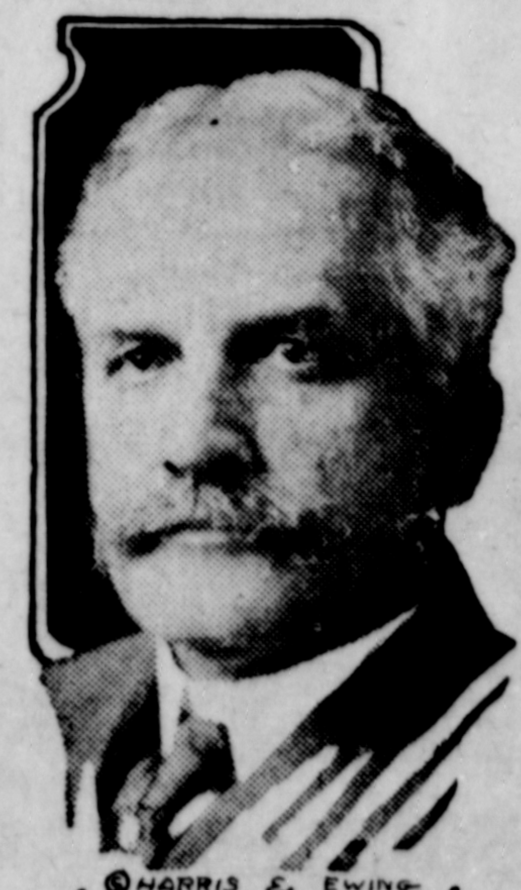
K. VON BOHLEN HALBACH.

Essen, Germany, Aug. 22.—Krup von Bohlen Halbach, who became the head of the world's greatest armor plate and gun making concern by marrying its owner, Miss Bertha Krupp, the richest woman in Europe, was