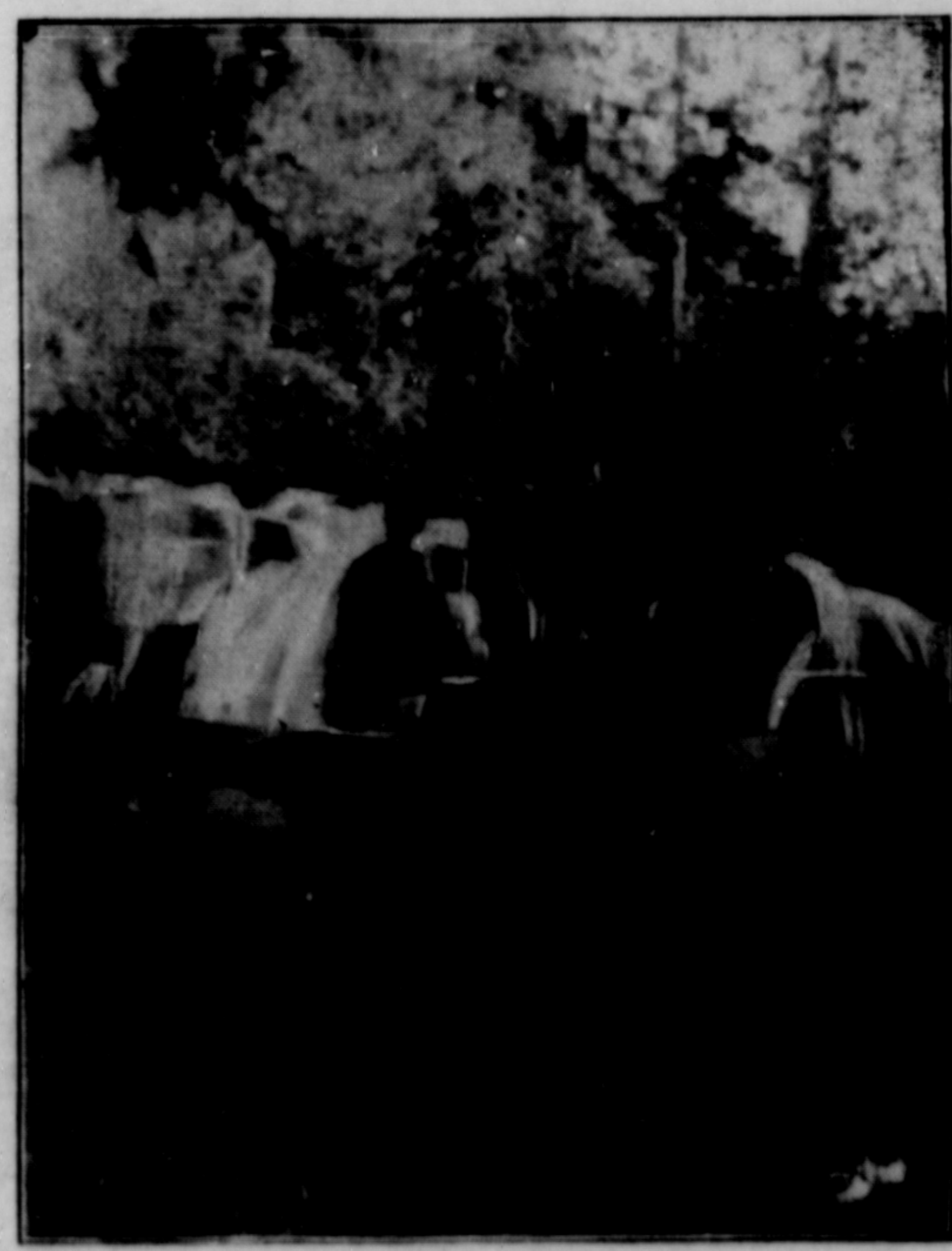
Favorite beauty spot of Prince Rupert, still as old-timers knew it but doomed to change also.