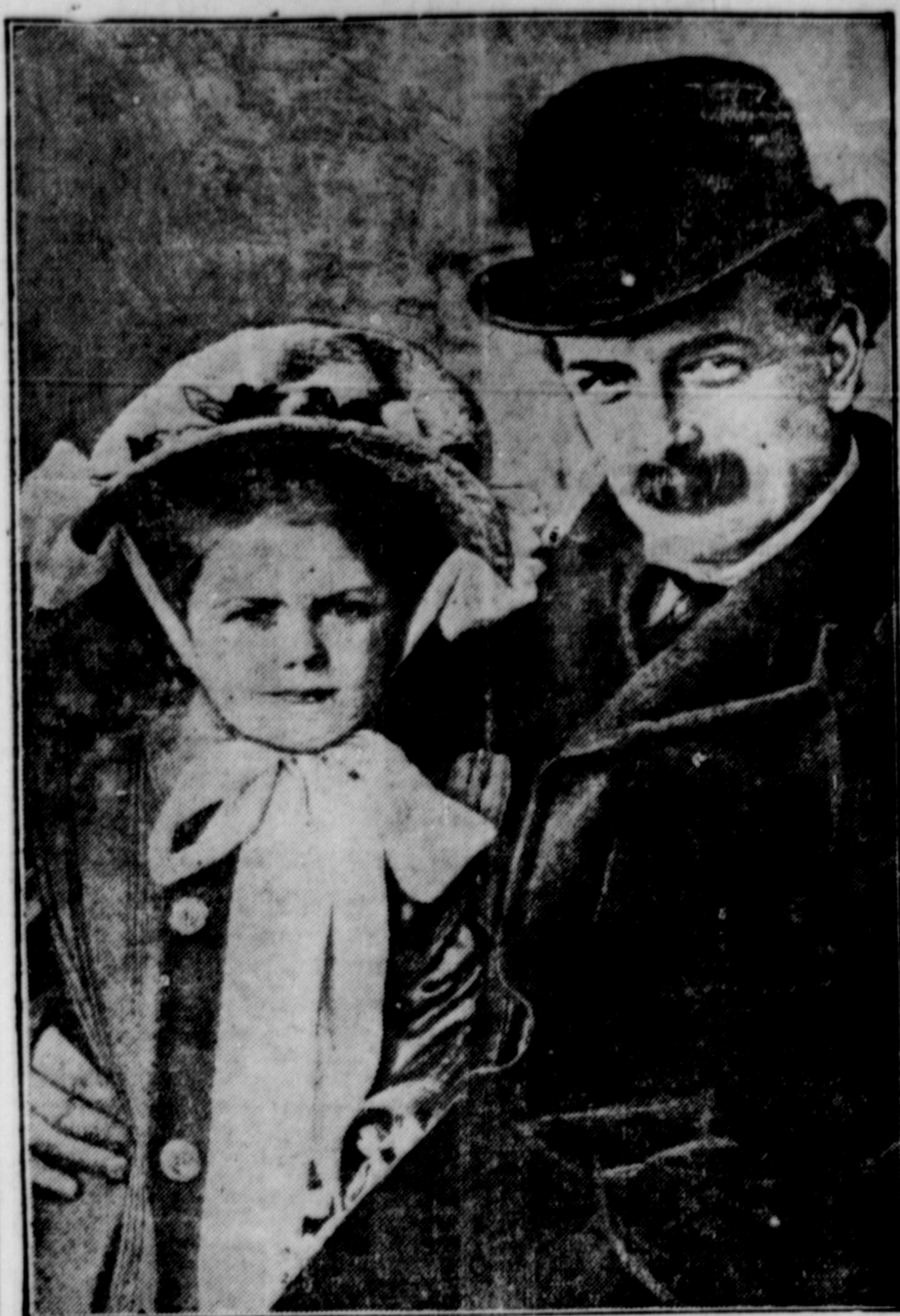
LLOYD-GEORGE AND HIS DAUGHTER