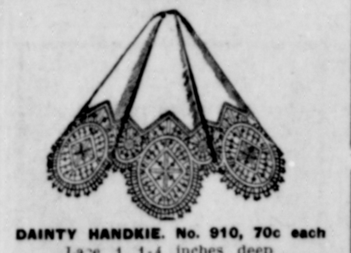
DAINTY HANDKIE. No. 910, 70c each. Lace 1 1/4 inches deep

made by the cottagers of BUCKINGHAMSHIRE Our laces were awarded the Gold Medal at the Festival of Empire and Imperial Exhibition, Crystal Palace, 1911