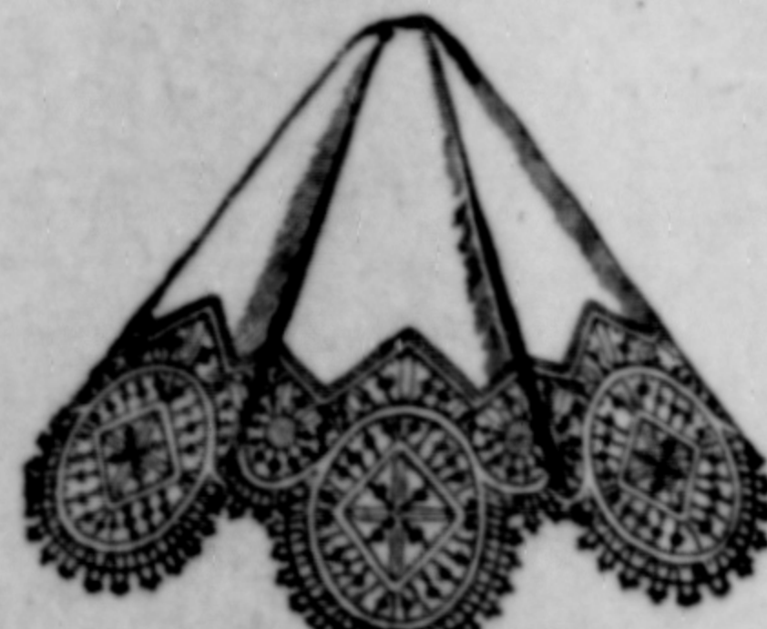
DAINTY HANDKIE. No. 910, 70c each Lace 1 1-4 inches deep

made by the cottagers of BUCKINGHAMSHIRE Our laces were awarded the Gold Medal at the Festival of Empire and Imperial Exhibition, Crystal Palace, 1911