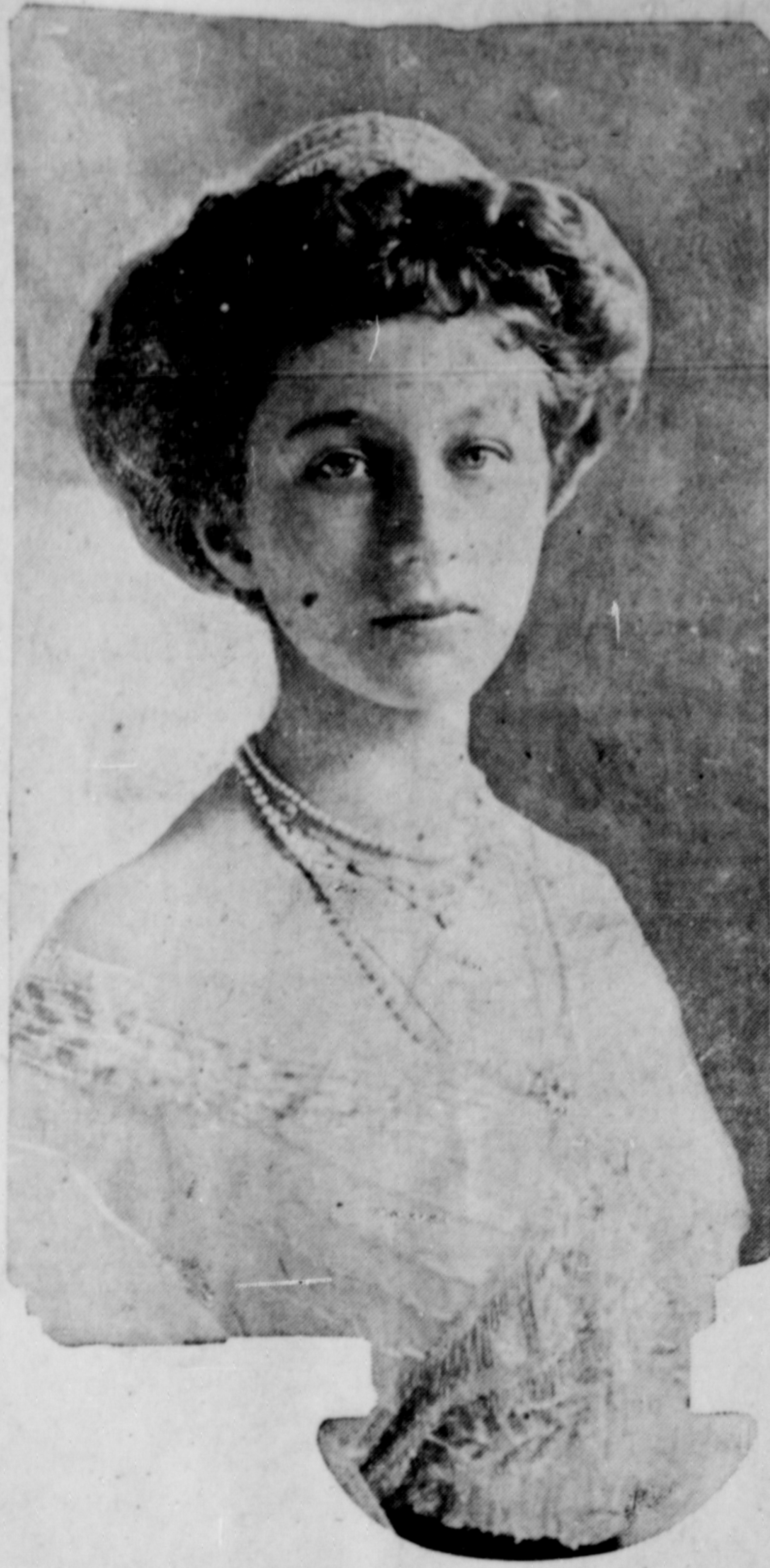
PRINCESS LOUISE VICTORIA OF PRUSSIA.

WATER NOTICE. For a License to Take and Use Water. Notice is hereby given that The Prince Rupert Hydro-Electric Company, Limited, intends to take and use 50 cubic feet per second of water out of Madeline Creek, which flows in an easterly direction through Crown lands, and empties into Hecetai River about 13 miles from its mouth on the south bank.