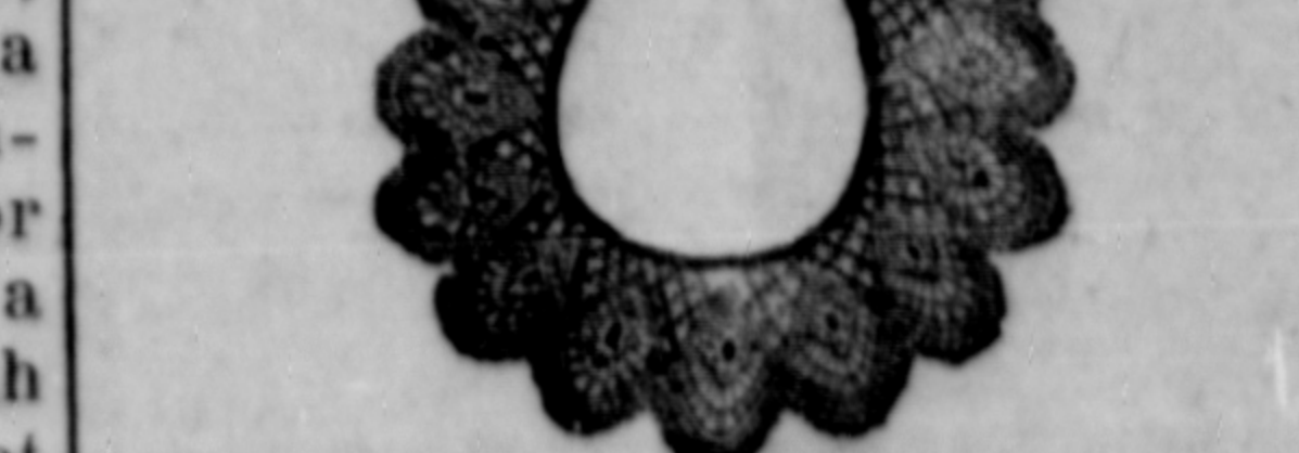
16TH CENTURY DESIGN COLLAR $1.00 3 in. deep.

Buy some of this hand made Pillow Lace, it LASTS many times longer than any machine made variety, and imparts quite an air of distinction to the possessor, at the same time supporting the village lace-makers, bringing them many little comforts otherwise unobtainable on an agricultural man's wage. Write for the absorbing and descriptive little treatise entitled "An Interesting Home Study," which contains over 100 striking examples of the lace maker's art, and is sent POST FREE to any part of the world.