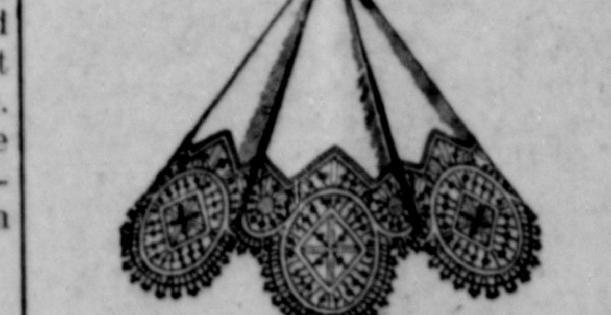
DAINTY HANDKIE. No. 910, 70c each. Lace 1 1/4 inches deep.

made by the cottagers of BUCKINGHAMSHIRE. Our laces were awarded the Gold Medal at the Festival of Empire and Imperial Exhibition, Crystal Palace, 1911.