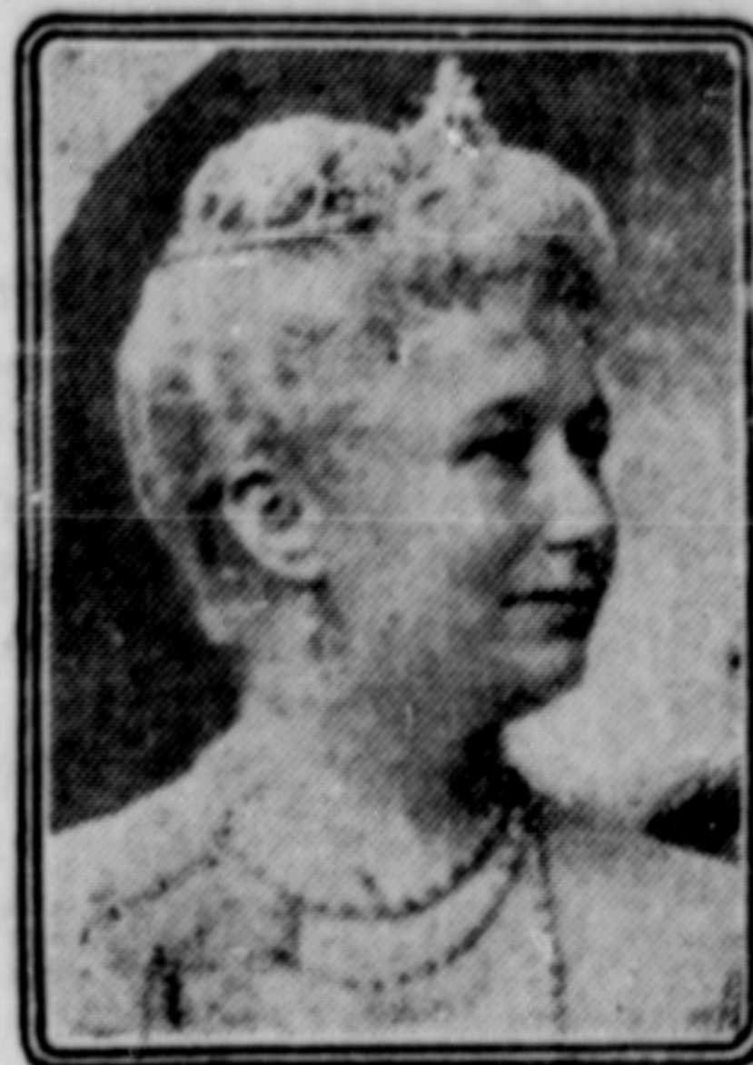
EMPEROR OF GERMANY.