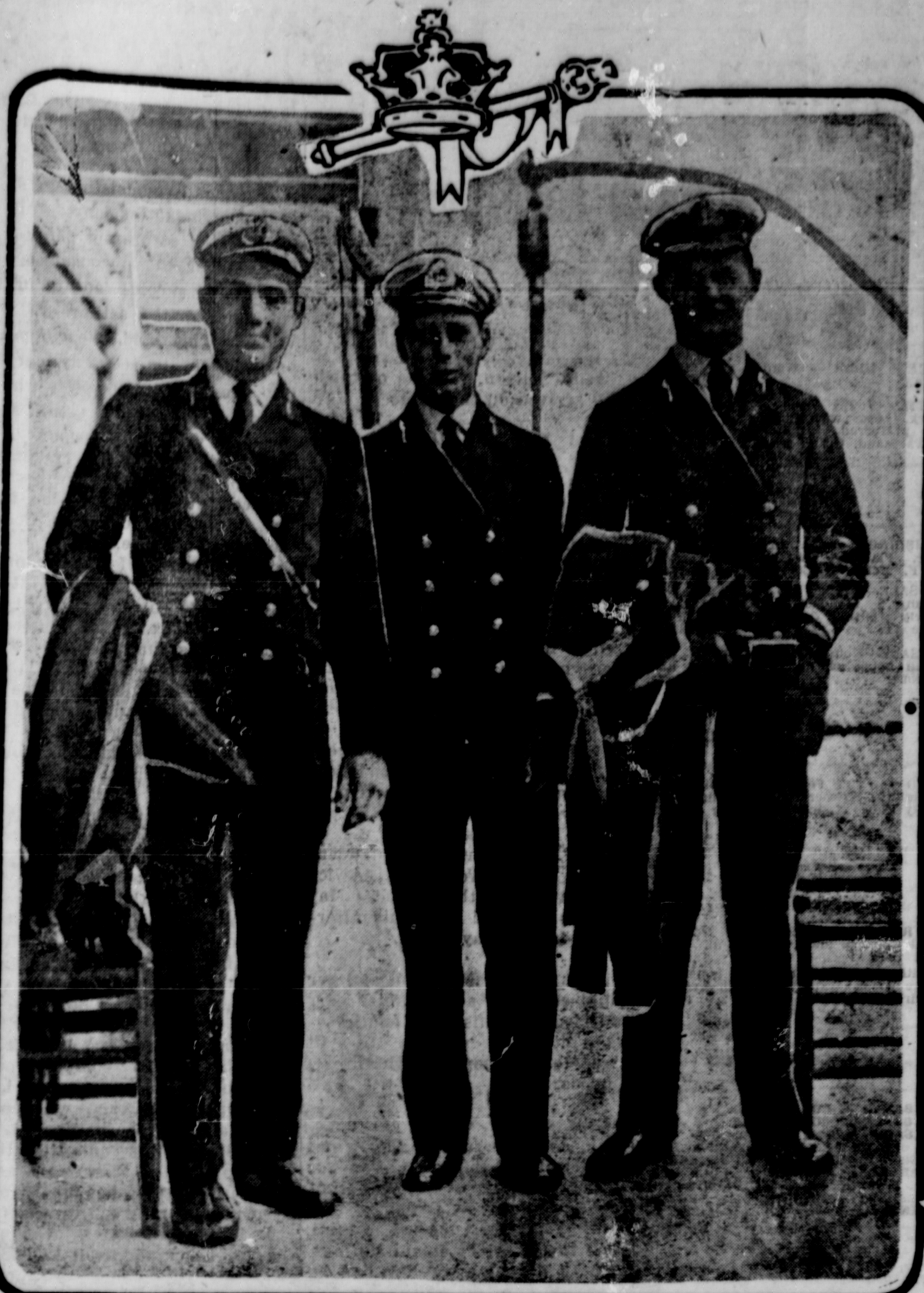
PRINCE ALBERT AS A CANADIAN LAKE SAILOR.

For a License to Take and Use Water. Notice is hereby given that The Prince Rupert Hydro-Electric Company, Limited, of Prince Rupert, B. C., will apply for a license to take and use 50 cubic feet per second of water out of Madeline Creek, which flows in an easterly direction through Crown lands, and empties into mouth of the Skeena about 13 miles from its mouth on the south bank. The water will be diverted at unnamed falls about one mile from mouth of creek, and will be used for generating electric power purposes for sale, barter or exchange within a radius of 100 miles. This notice was posted on the ground on the 16th day of May, 1913. The application will be filed in the office of the Water Recorder at Prince Rupert, B. C. Objections may be filed with the said Water Recorder or with the Comptroller of Water Rights, Parliament Buildings, Victoria, B. C. PRINCE RUPERT HYDRO-ELECTRIC CO., LTD. By Geo. H. Kohl, Agent. Pub. May 26, 1913—June 16, 1913.