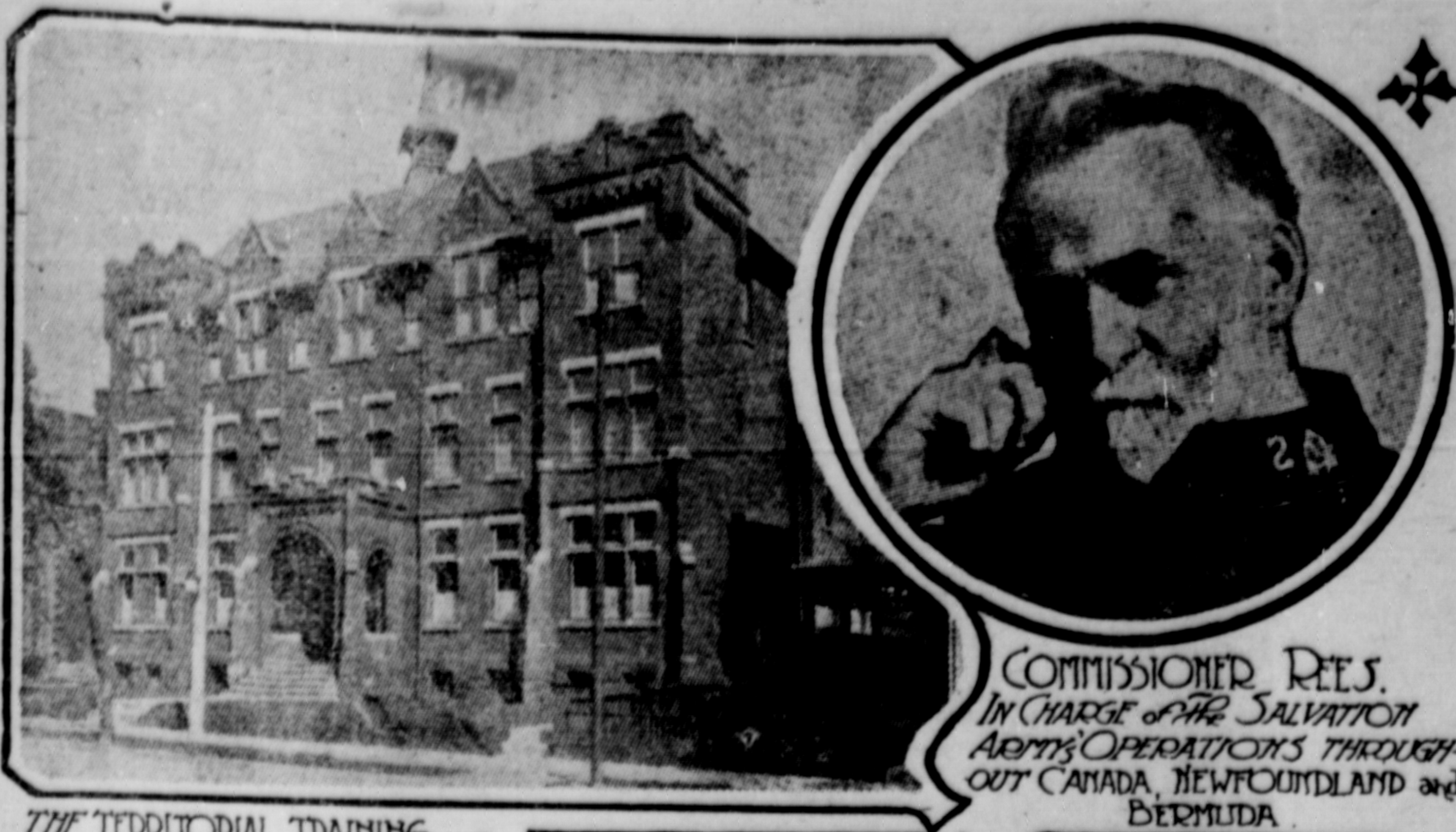
THE TERRITORIAL TRAINING COLLEGE.

For a License to Take and Use Water. Notice is hereby given that The Prince Rupert Hydro-Electric Company, Limited, license to take and use 50 cubic feet per second of water out of Madeline Creek, which flows in an easterly direction through Crown lands, and empties into mouth of the south bank. The water will be diverted at an unnamed falls about one mile from mouth of creek, and will be used for generating electric power purposes for sale, barter or exchange within a radius of 100 miles. This notice was posted on the ground on the 16th day of May, 1913. The application will be filed in the office of the Water Recorder at Prince Rupert, B. C. Objections may be filed with the said Water Recorder or with the Comptroller of Water Rights, Parliament Buildings, Victoria, B. C. PRINCE RUPERT HYDRO-ELECTRIC CO., LTD. By Geo. H. Kohl, Agent. Pub. May 20, 1913—June 10, 1913.