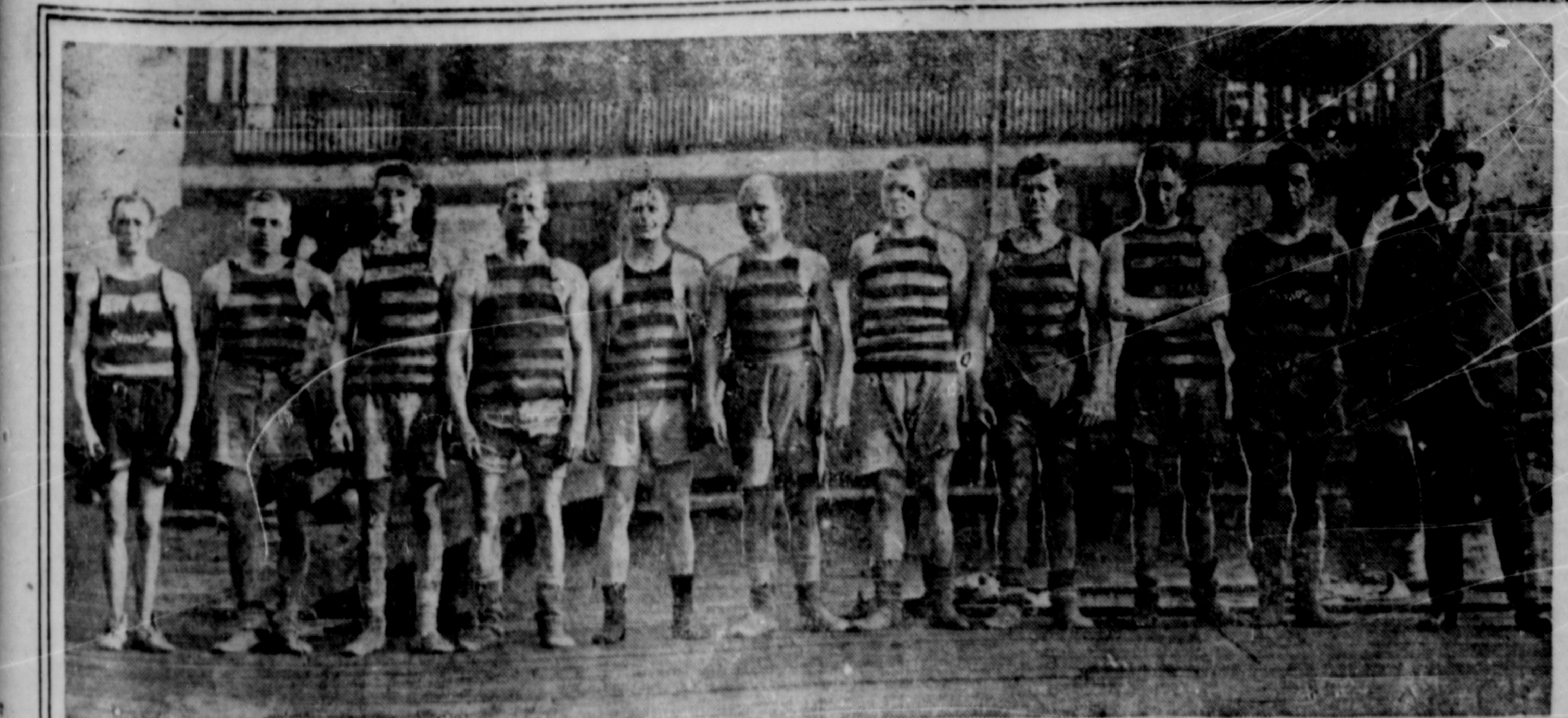
THE ARGONAUT CREW THAT RECENTLY SAILED FROM MONTREAL TO ENGLAND.