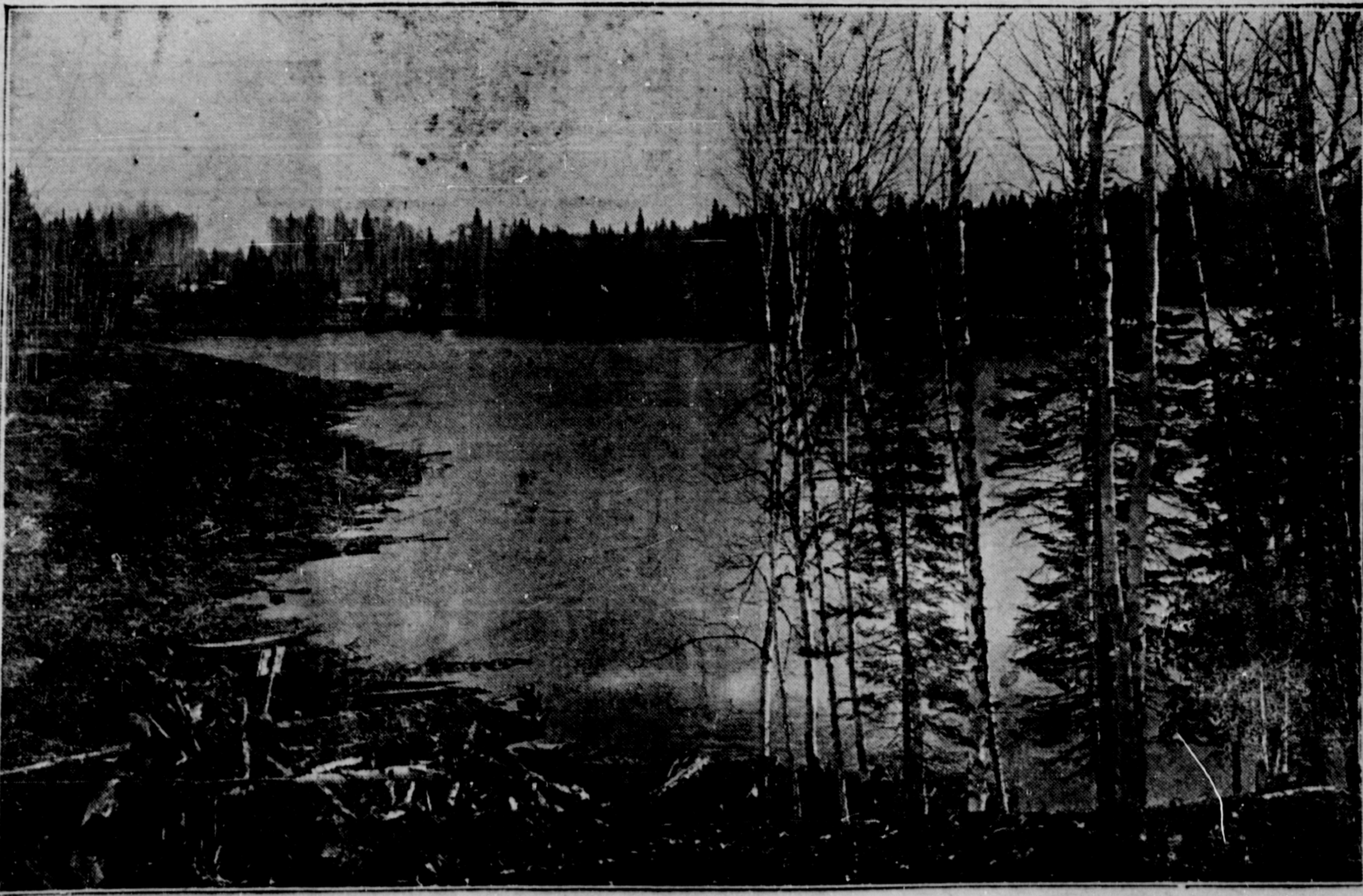
THE FOREST CLAD DISTRICT THAT SURROUNDS THE THREATENED TOWN OF COCHRANE.

This picture is typical of hundreds of square miles to the east and west of the T. & N. O. Railway, in which forest fires are raging. Elk Lake, Matheson, Earleton and Charlton are surrounded by just such forest growth.