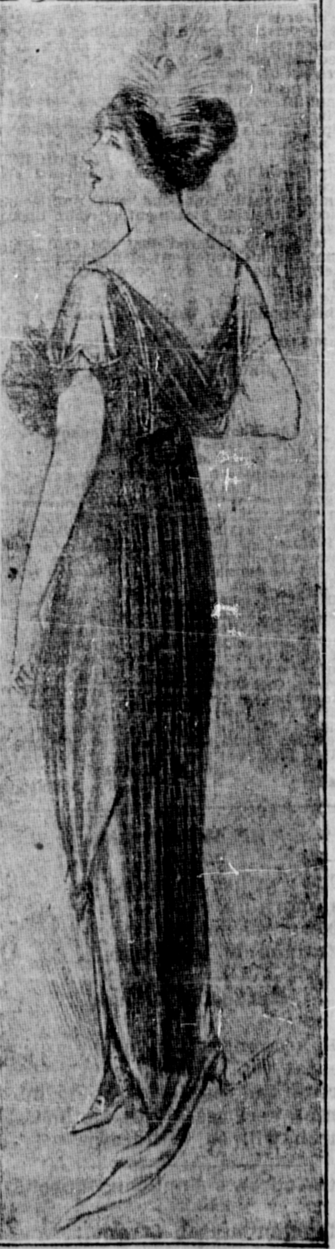
A LOVELY EVENING DRESS. Of wild poppy color, draped with black net embellished with rivers of diamonds.

The first attempt at exploiting the great fishing beds at the north end of Graham Island was made this year by four hundred men engaged by the Atlin Cold Storage Company, the B. C. Fisheries and the Wallace Fisheries.