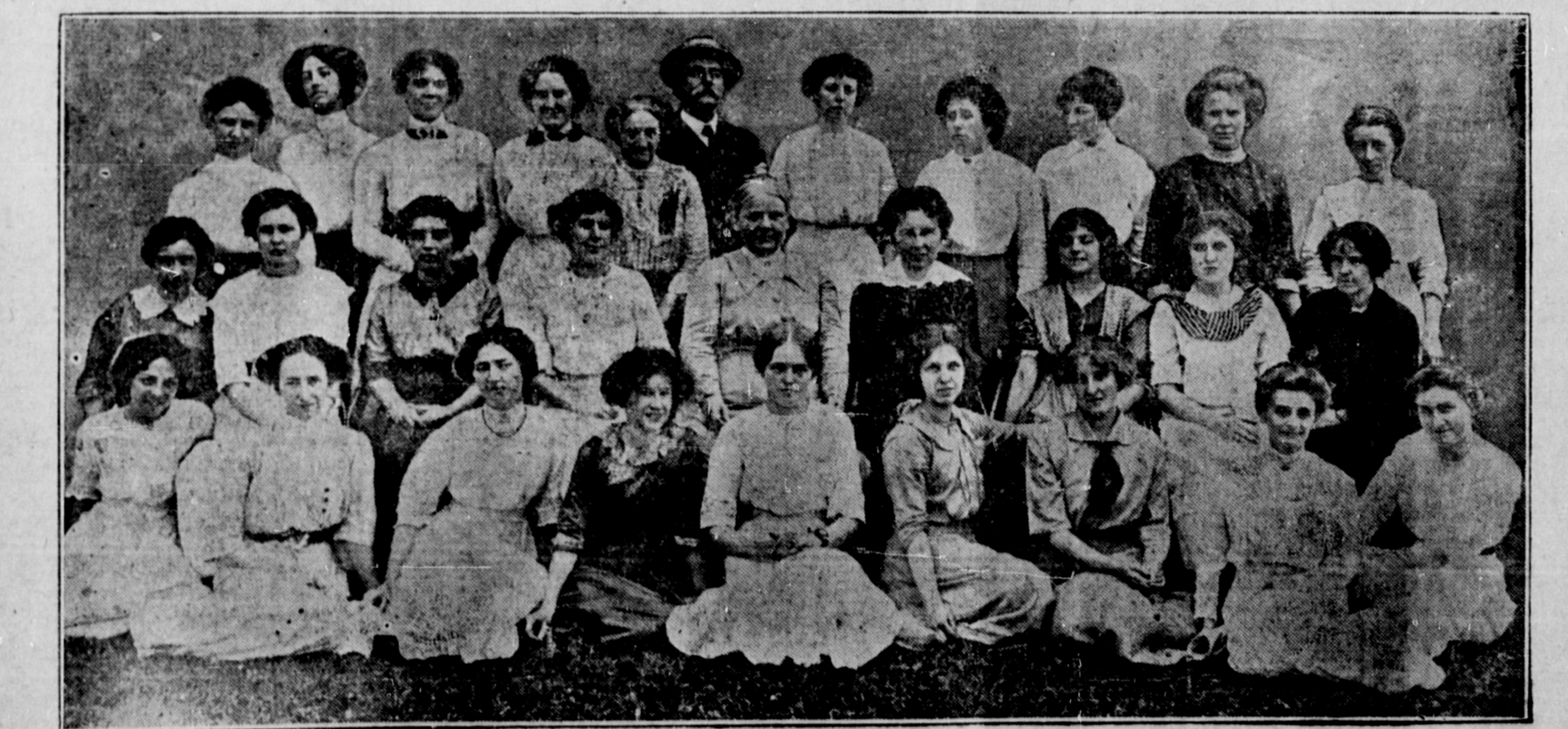
SUMMER SCHOOL FOR PUBLIC LIBRARIANS.