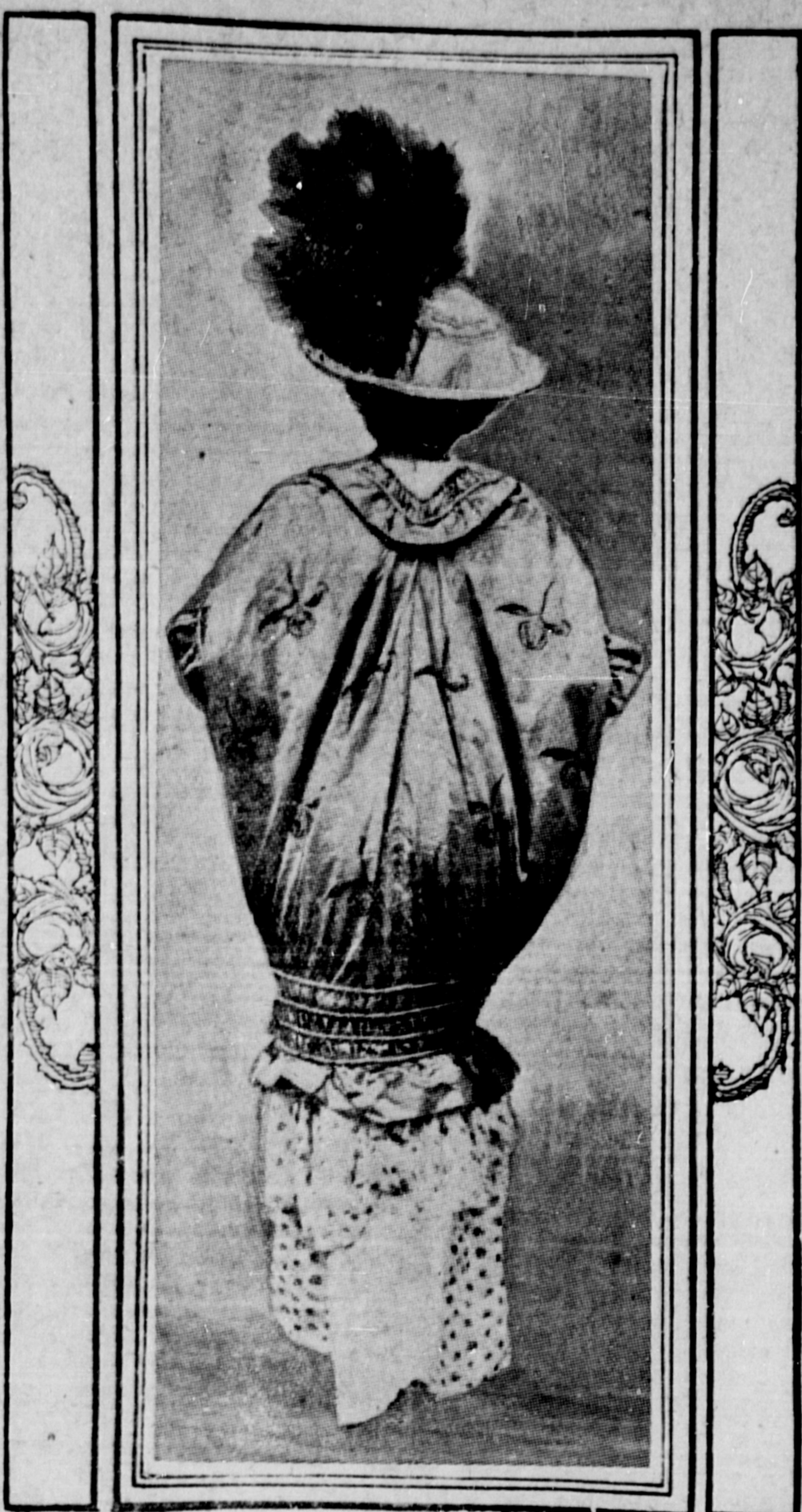
WELL, WHAT DO YOU THINK OF THIS?

Take notice that the PORT EDWARD TOWNSHIP COMPANY, LIMITED, of Prince Rupert, in the Province of British Columbia, will apply to the Comptroller of Water Rights for the approval of the plans of the works to be constructed for the utilization of the water from Wolf Creek, Skeena District, for which application has been made by the company, and under which application Permit No. 107 has been issued by the Comptroller of Water Rights, granting permission to the said PORT EDWARD TOWNSHIP COMPANY, LIMITED, to make surveys for construction of the works for diversion of two cubic feet per second from said Wolf Creek for Municipal Purposes. The plans and particulars required by Section One of the "Water Act" and of the "Water Rights Act" for approval by the Comptroller of Water Rights are as follows: A plan of the works to be constructed, showing the location of the works, the nature of the works, and the area of land to be occupied by the works, and a plan of the works to be constructed, showing the location of the works, the nature of the works, and the area of land to be occupied by the works. Objections to the application may be filed with the Comptroller of Water Rights, at Prince Rupert, B. C., on or before the 15th day of August, 1913. By A. W. ARNEW, Agent. July 14, 1913.