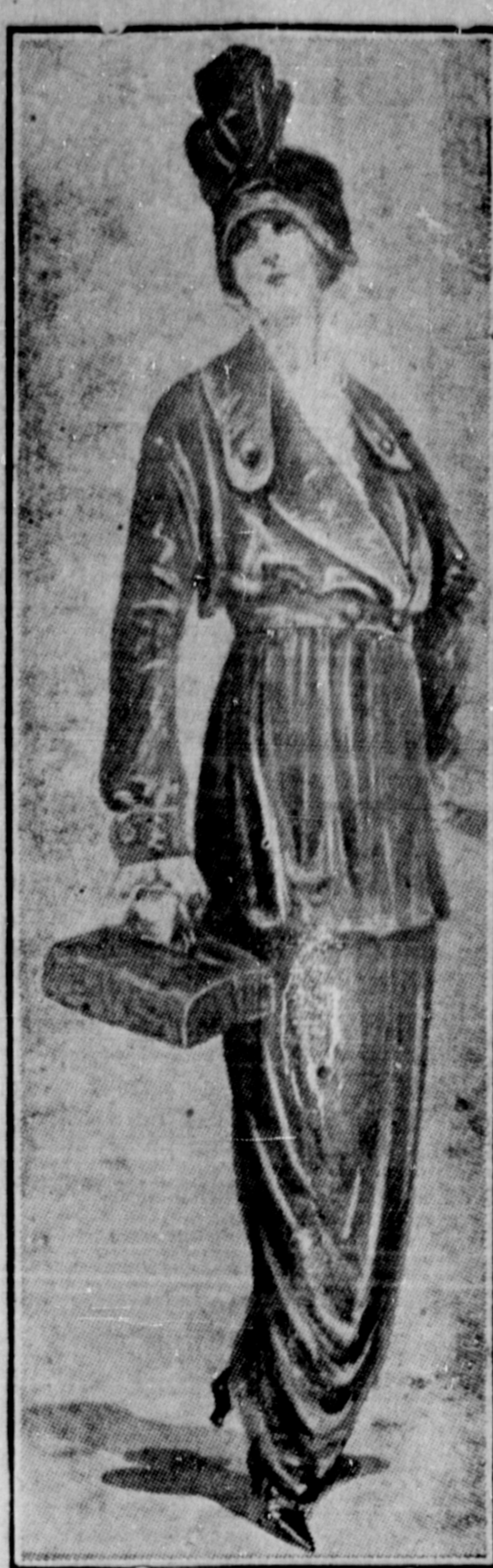
NEW FALL MODEL