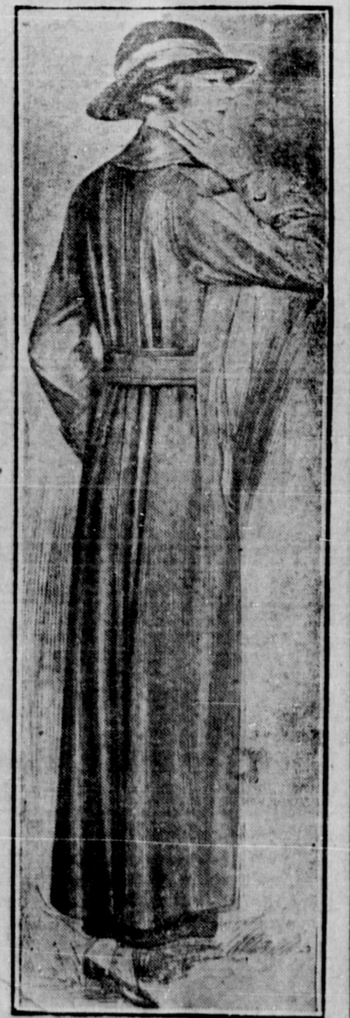
A NEW FALL COAT