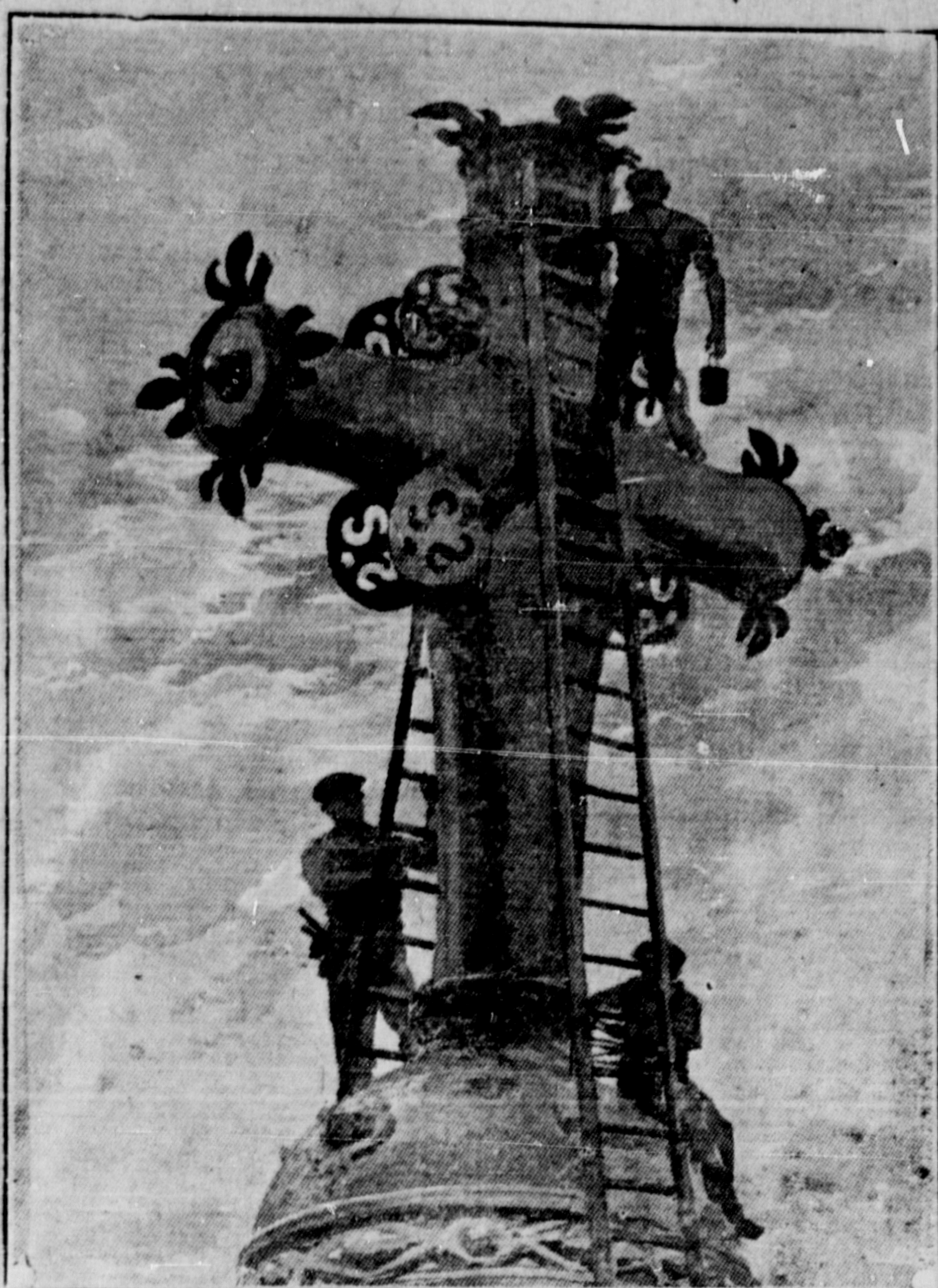
GILDING THE CROSS OF ST. PAUL'S CATHEDRAL