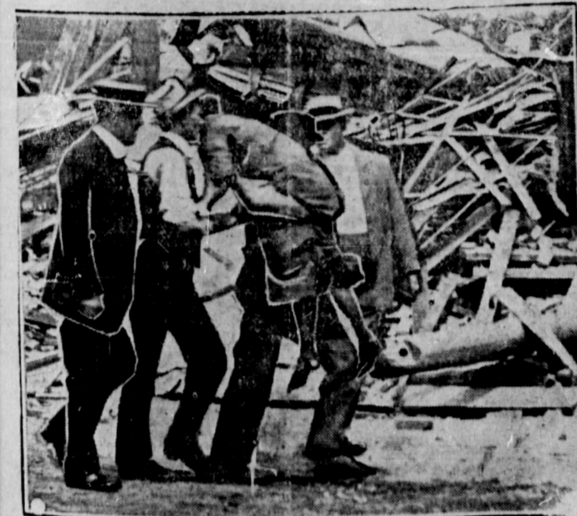
REMOVING THE BODY OF A GIRL CLERK

Newest styles and materials in ladies' suits and ladies' misses' and children's coats at Wallace's. 2101st