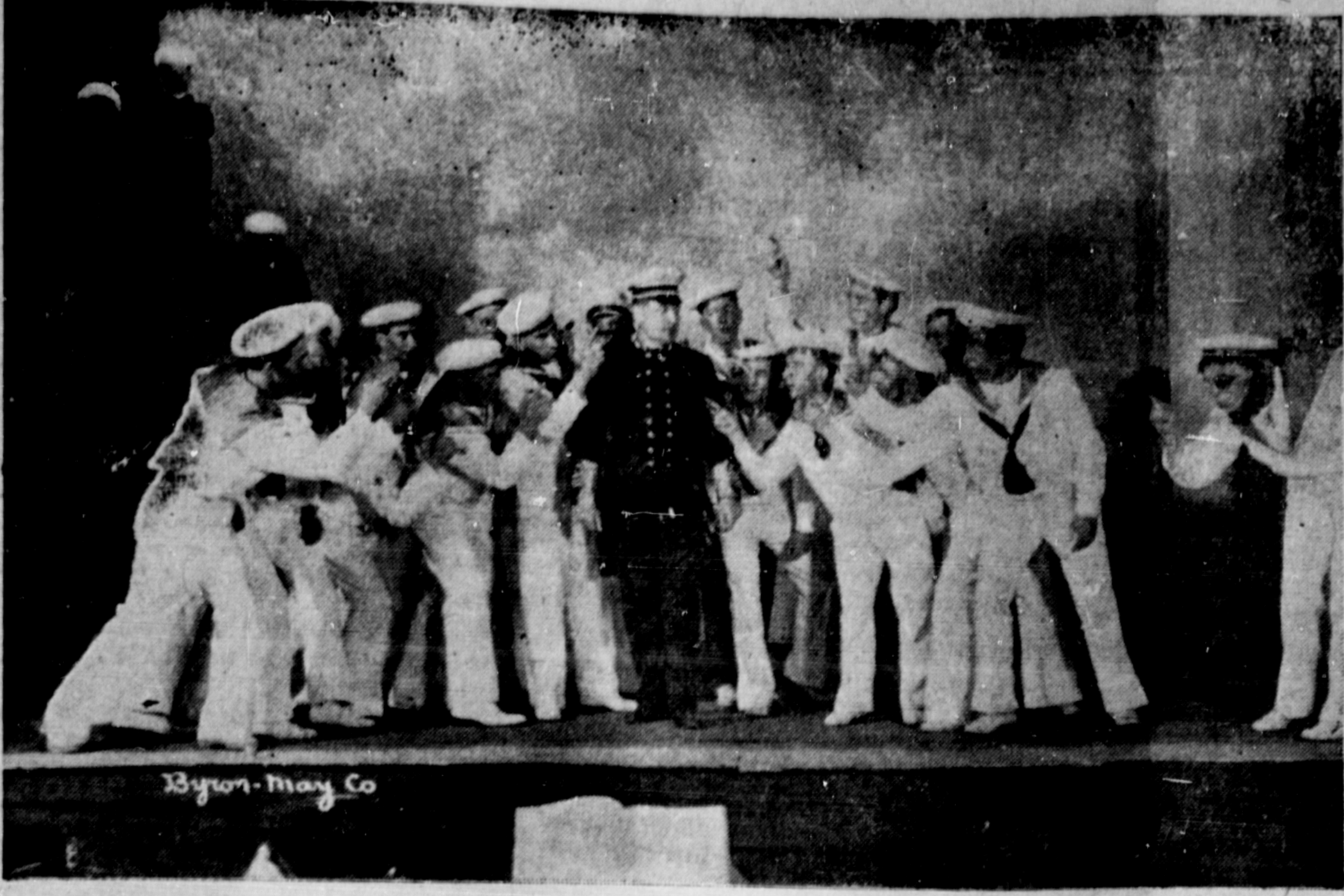
SCENE FROM H. M. S. PINAFORE, TO BE PRESENTED BY THE POLLARD JUVENILE OPERA CO. AT THE WESTHOLME OPERA HOUSE TONIGHT.

Application for a license to take and use water will be made under the Water Act of British Columbia as follows: 1. The name of the applicant is B. C. Salt Works, Ltd., F. H. Mobley, agent. 2. The address of the applicant is Prince Rupert, B. C. 3. The name of the stream is Kwinitsa River. The stream has its source in mountain range about 5 miles west of the Skeena River, flows in a southeasterly direction and empties into Skeena River about 1 mile south from Kwinitsa station. 4. The water is to be diverted from the stream on the south side, about 5,280 feet from mouth. 5. The purpose for which the water will be used is mining and manufacturing. 6. The land on which the water is to be used is described as follows: Mineral claims owned by the B. C. Salt Works, Ltd., and located adjacent to Lot 74 and Lot 75, Skeena River. 7. The quantity of water applied for is 12,000 cubic feet. 8. This notice was posted on the ground on the 6th day of September, 1913. 9. A copy of this notice and an application pursuant thereto and to the requirements of the Water Act will be filed with the Controller of Water Rights, at Prince Rupert, B. C. Objections may be filed with the said Water Recorder at Prince Rupert, B. C. or with the Controller of Water Rights, at Prince Rupert, B. C. By F. H. Mobley, Agent. W-Sept. 8 to Oct. 6, 1913.