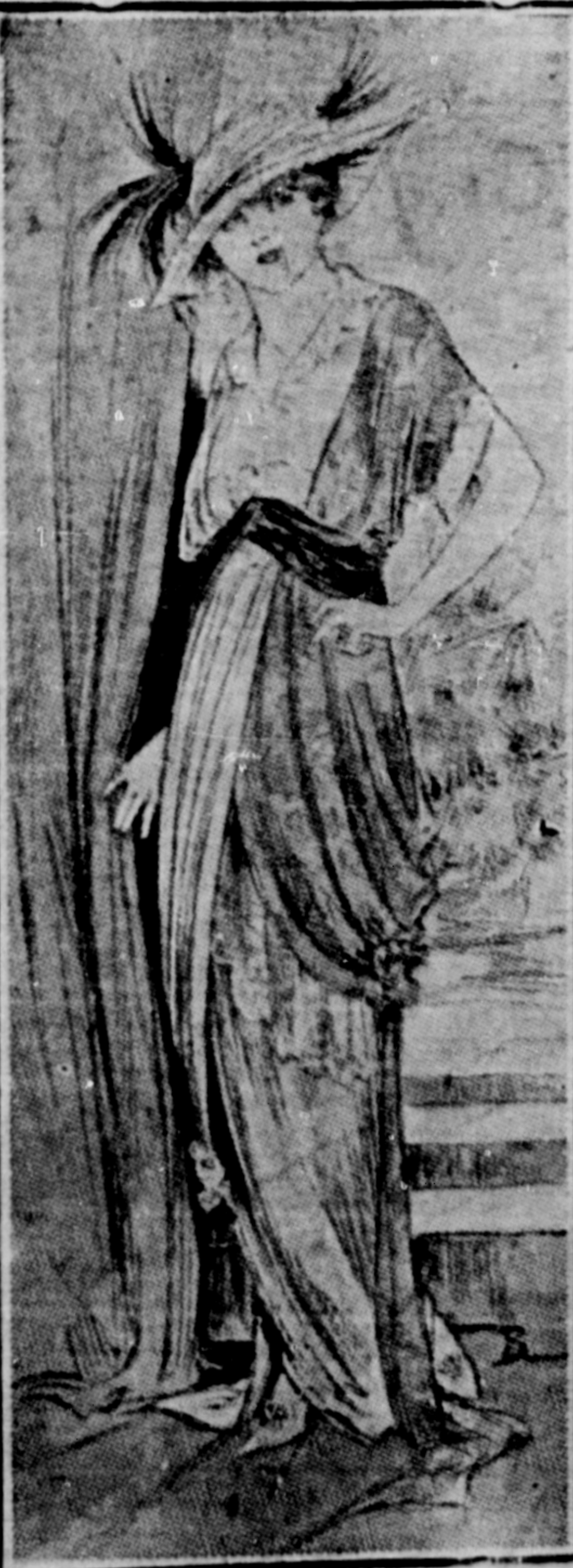
IN SOFT TAFFETA.

Advice regarding your advertising problems is available through any recognized advertising agency, or the Secretary of the Canadian Press Association, Room 503 Lansden Building, Toronto. Enquiry involves no obligation on your part—so write, if interested.