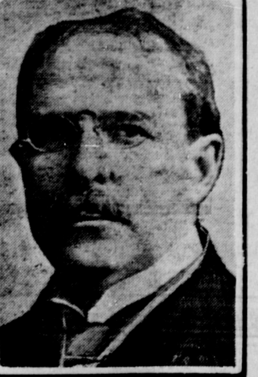
SENATOR GEO. T. OLIVER PITTSBURGH, PA.