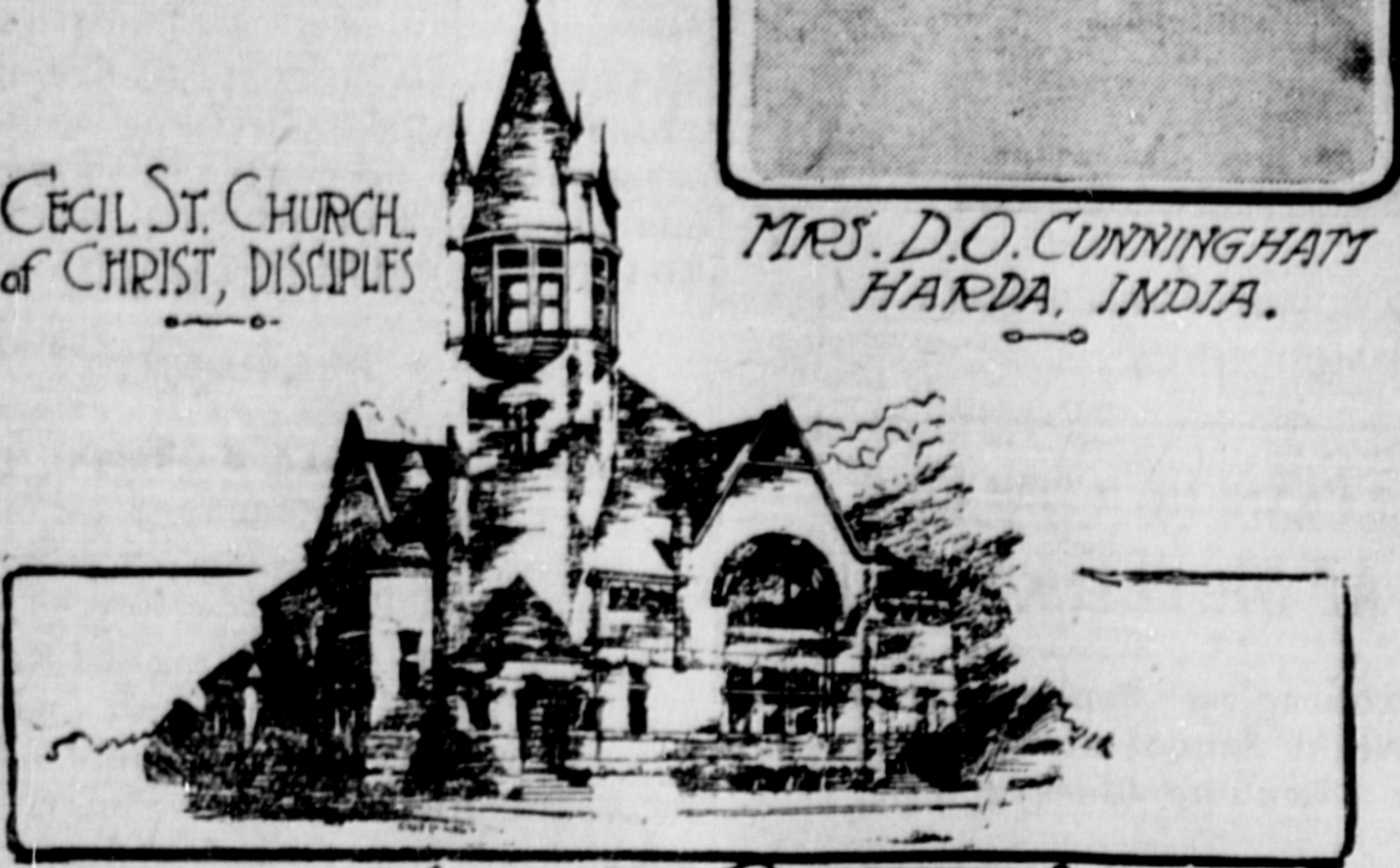
CECIL ST. CHURCH OF CHRIST, DISCIPLES. PROMINENT PEOPLE AMONG 4000 DELEGATES TO THE DISCIPLES CONVENTION IN TORONTO WHICH OPENED ON TUESDAY MORNING