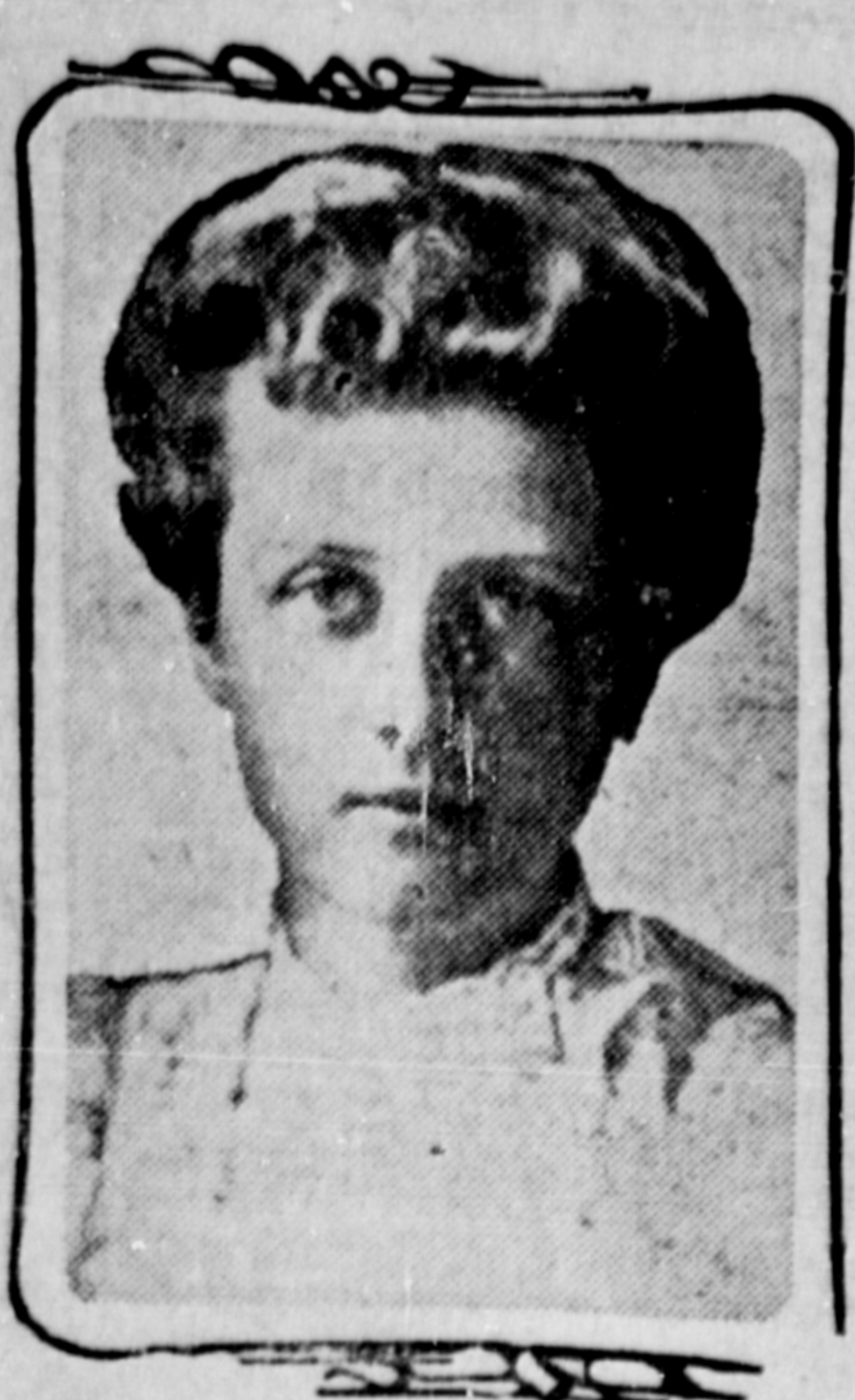
ROYAL WEDDING TODAY.

Take notice that I, Charles H. Flood, occupation free miner, intend to apply to the Commissioner of Lands and Works for permission to purchase the following described land: Commencing at a post planted at the northeast corner of A. P. L. reading Lot Post 2237-3235, thence in a northerly direction along the shore of Hastings Arm 20 chains more or less to the T. L. L. An Indian reservation No. 24, thence in a westerly direction 40 chains, thence east-southerly direction 80 chains, thence east-southerly 40 chains to the point of commencement, containing 220 acres more or less.