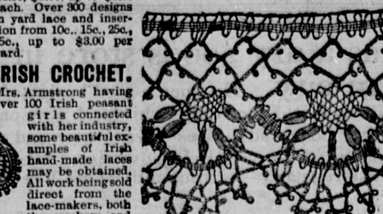
(1 1/2 in. deep) STOCK—Wheel Design. Price 35c. each. (Half shown.) No. 122.—80c. per yard.

Every sale, however small, is a support to the industry.