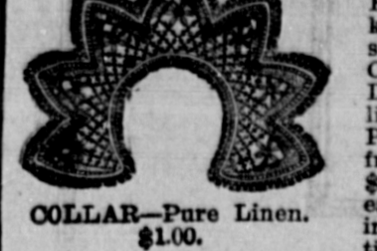
COLLAR—Pure Linen. $1.00.

Collars, Fronts, Plaques, Jabots, Yokes, Fichus, Berries, Handkerchiefs, Stocks, Camisoles, Chemise Sets, Tea Cloths, Table Centres, D'Osilies, Mats, Medallions, Quaker and Peter Pan Sets, etc. from 25c. to $1.00. $1.50, $2.00 up to $5.00 each. Over 300 designs in yard lace and insertion in yard lace, and within reach of the most modest purse.