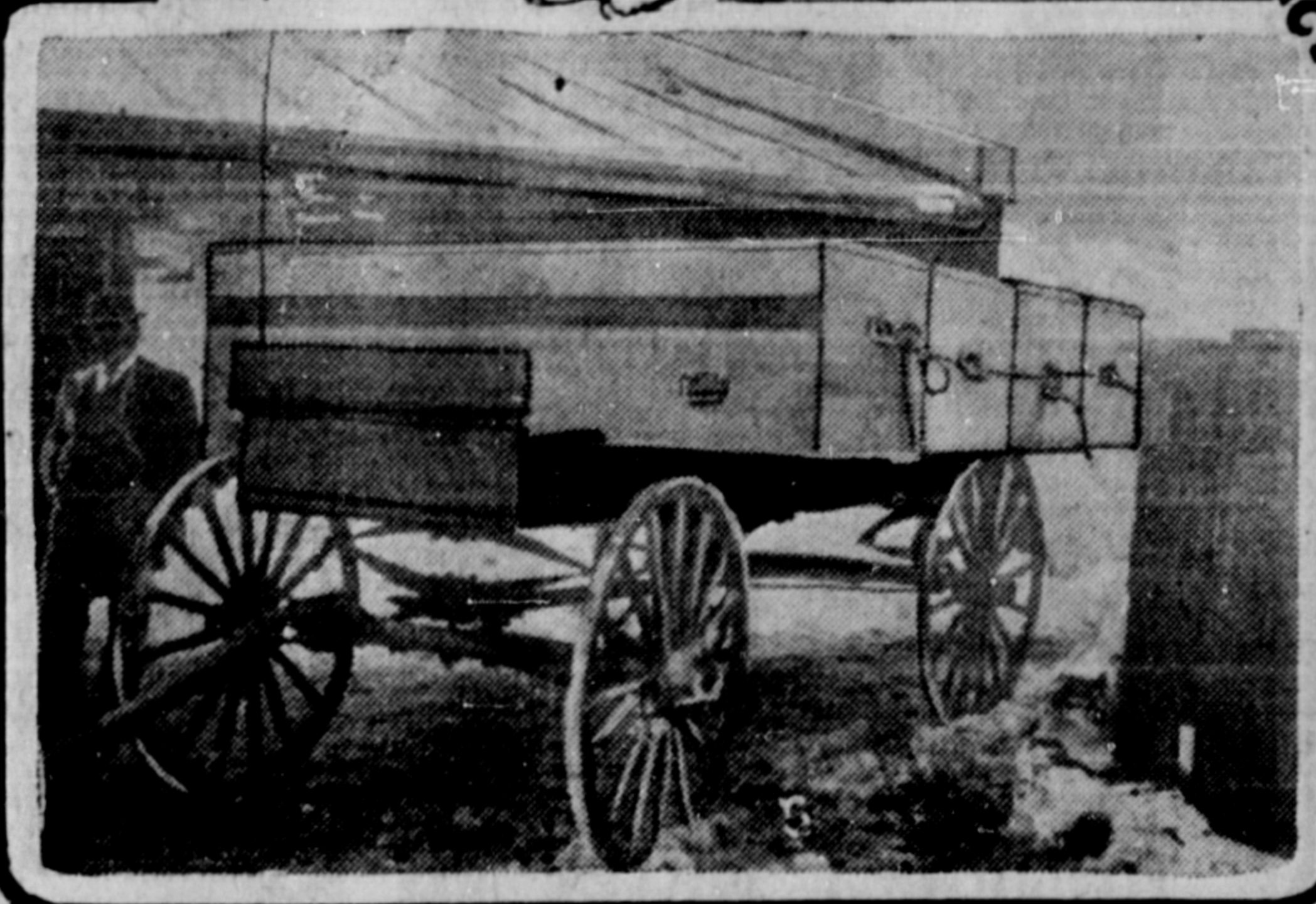
GRIM REMINDERS OF THE STORM TOLL.

The lower picture shows coffins containing wreck victims being carried away from the shore.