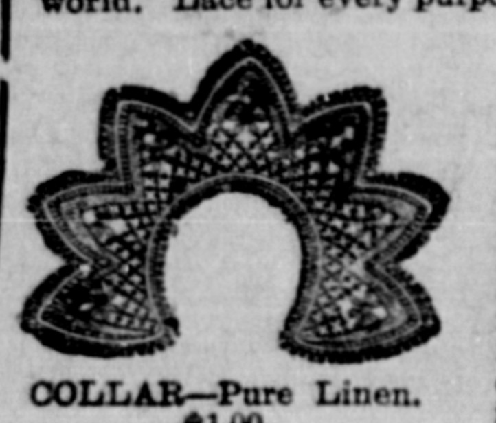
COLLAR—Pure Linen. $1.00.

Every sale, however small, is a support to the industry.