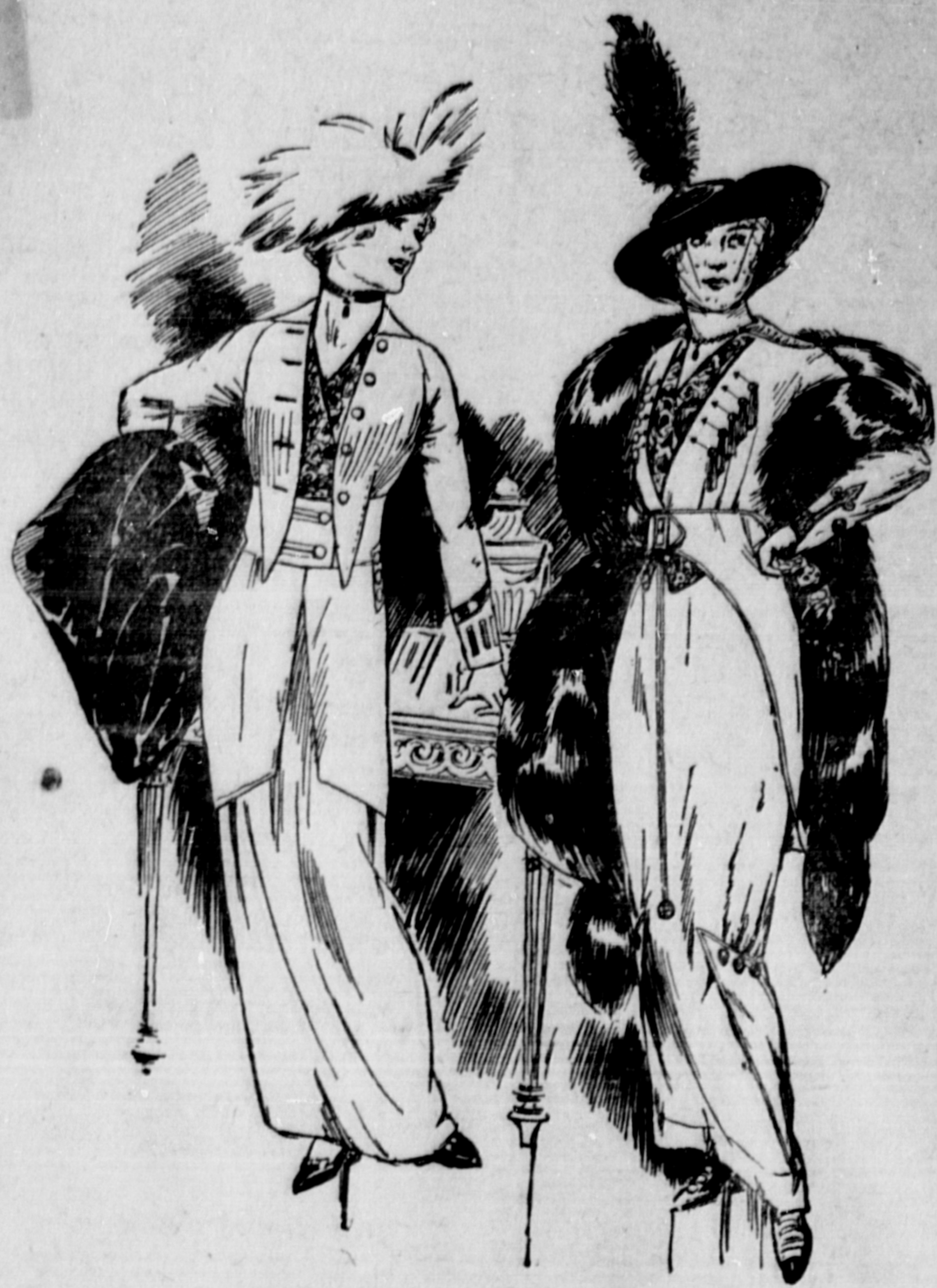
THE LATEST IN COATS AND SKIRTS