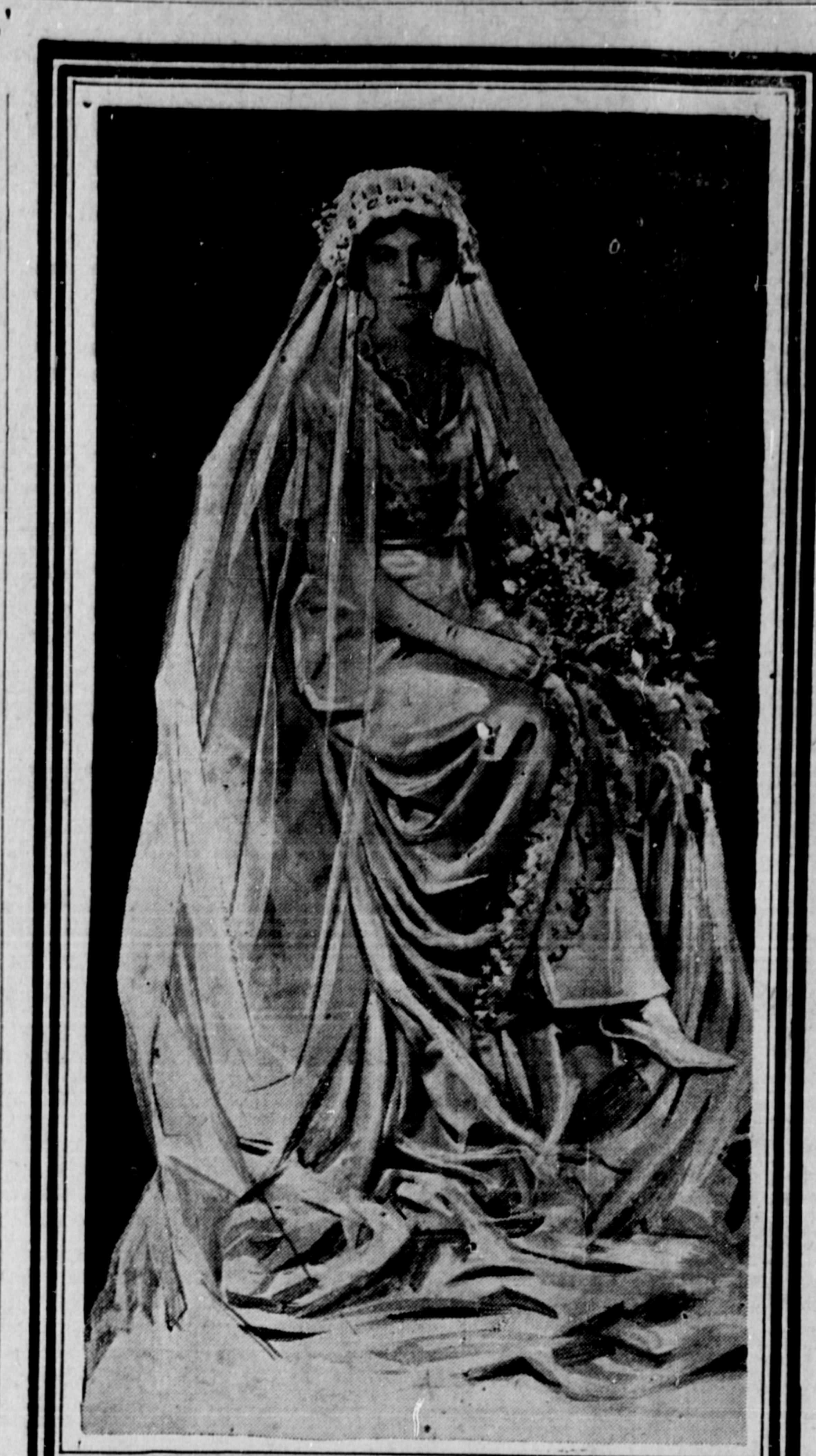
BRIDE OF THE WHITE HOUSE IN HER WEDDING GOWN