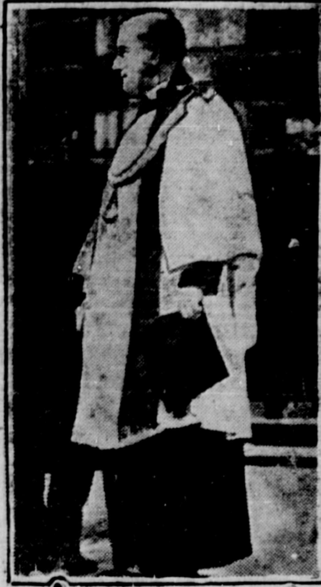
THE BENCH, BAR AND CRAFT HONOR SIR AEMIILIUS IRVING