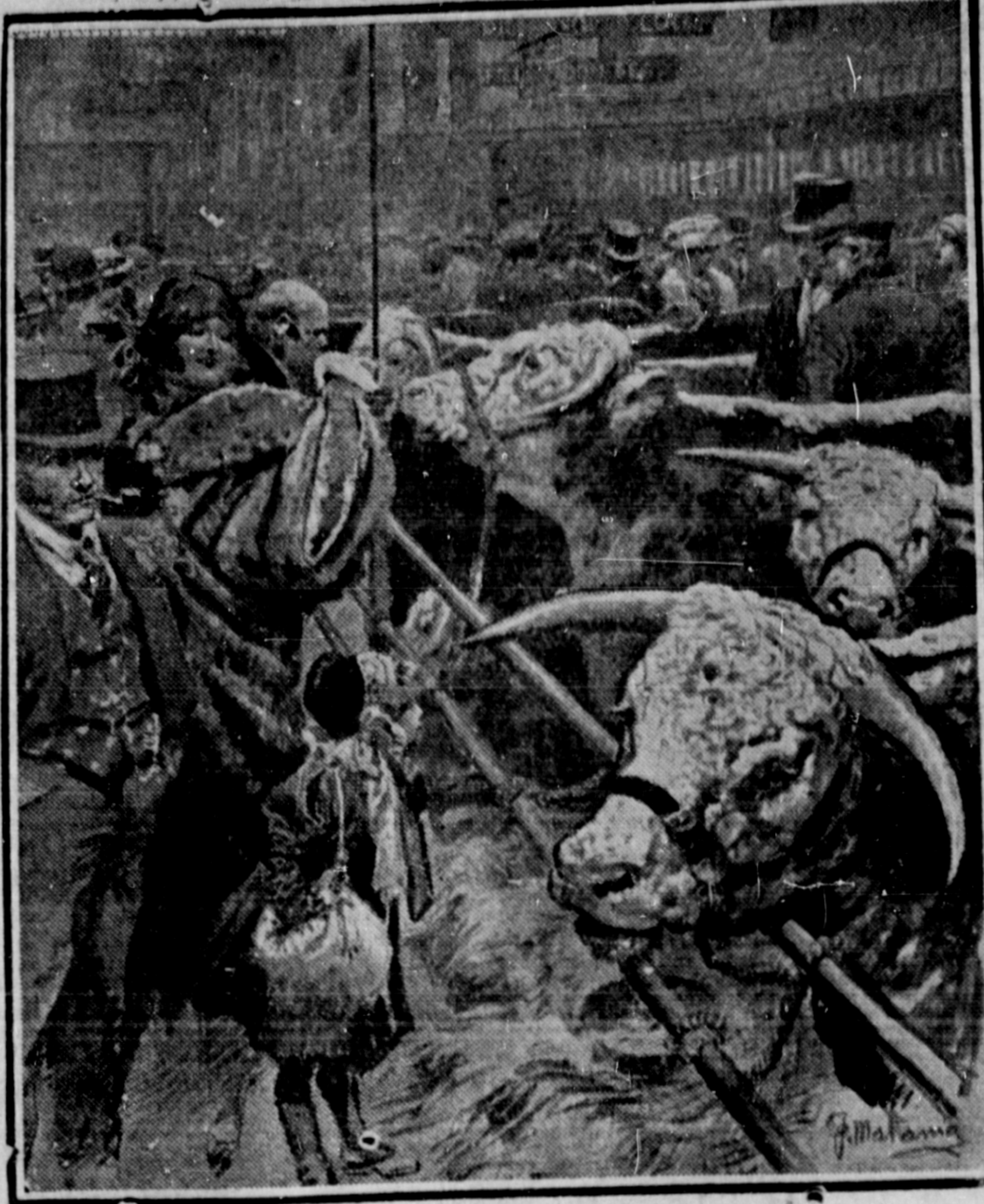
CRITICIZING THE HEREFORDS AT THE SMITHFIELD CLUB SHOW AT THE AGRICULTURAL HALL, LONDON ENGLAND