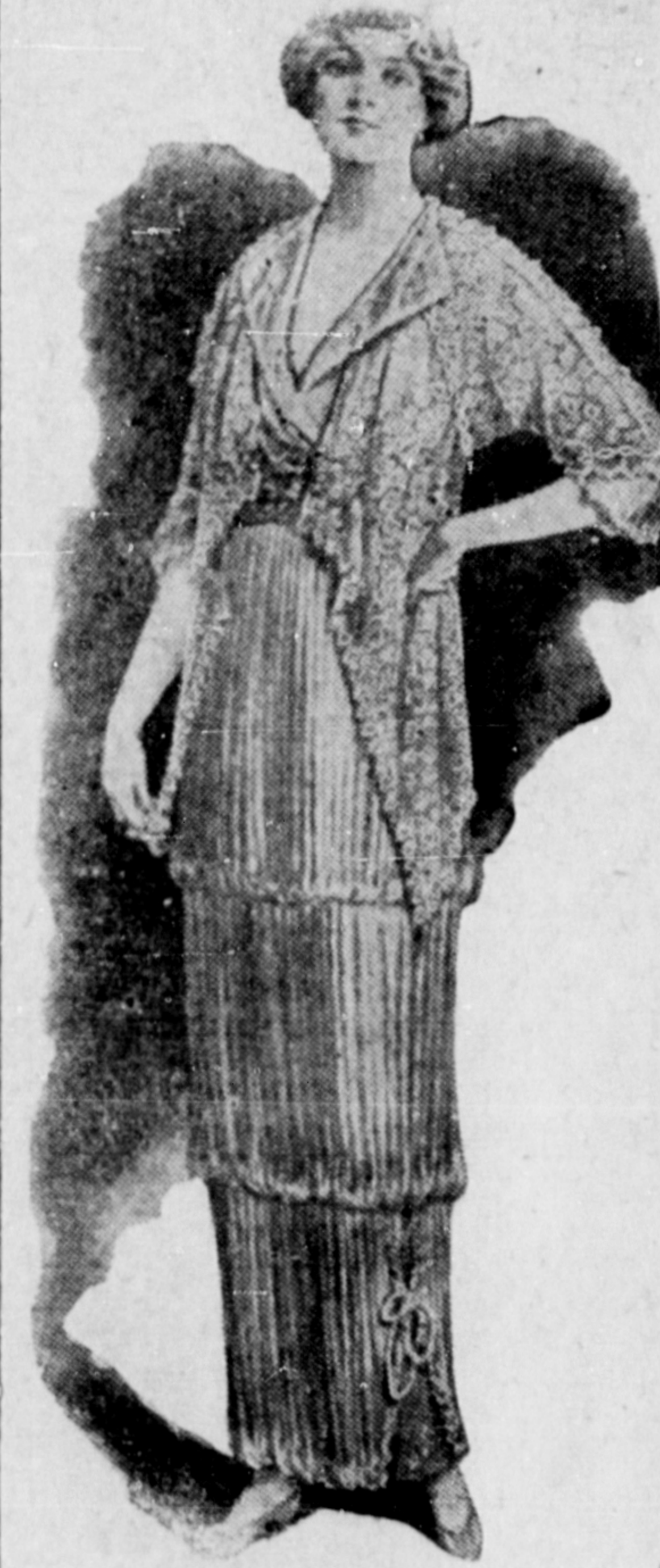
CHARMING REST GOWN Of shell pink accordion pleated nylon, accompanied with a coat of shadowy lace.