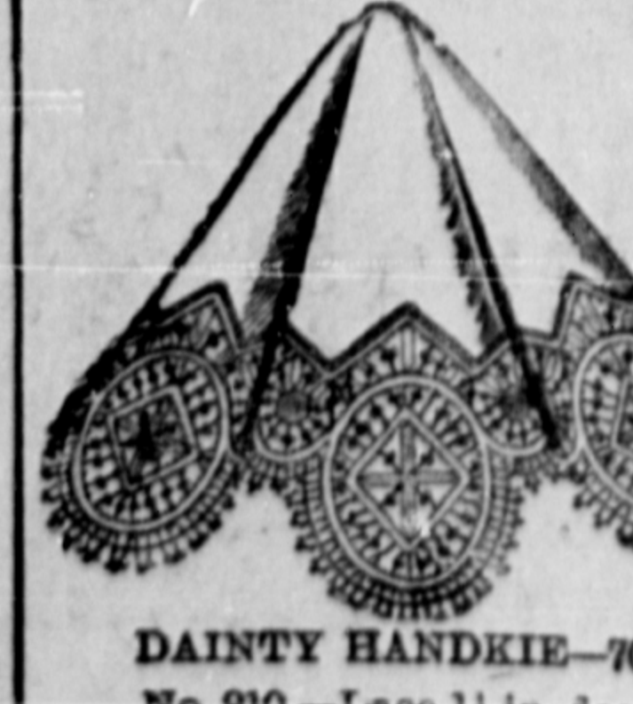
DAINTY HANDKERCHIEF—70c. No. 910.—Lace 1 1/2 in. deep.

Collars, Fronts, Plaistons, Jabots, Yokes, Fichus, Berthes, Handkerchiefs, Stocks, Camisoles, Chemise Sets, Tea Cloths, Table Centres, D'Oylyes, Mats, Medallions, Quaker and Peter Pan Sets, etc., from 25c. 60c., $1.00, $1.50, $2.50 up to $5.00 each. Over 200 designs in yard lace and insertion from 10c., 15c., 25c., 50c., up to $3.00 per yard.