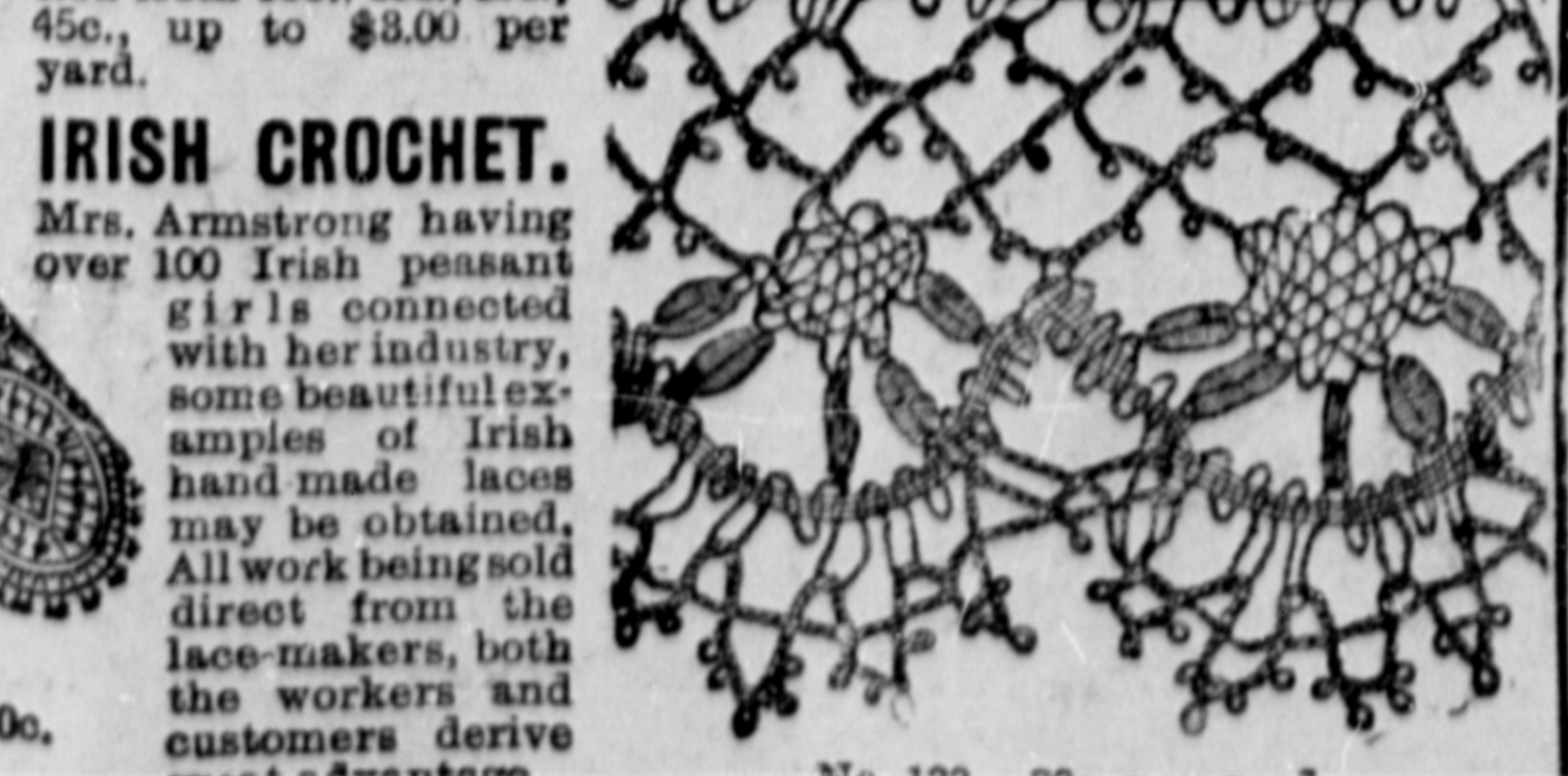
No. 122.—50c. per yard.