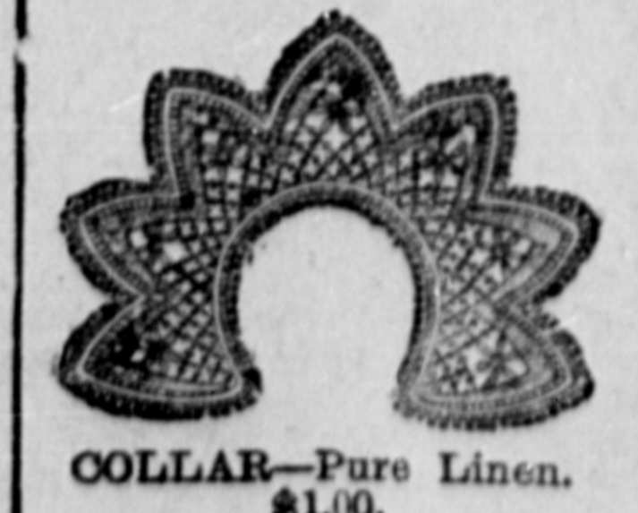
COLLAR—Pure Linen. $1.00

BUY some of this hand-made Pillow Lace, it lasts MANY times longer than machine made variety, and imparts an air of distinction to the possessor, at the same time supporting the village lace-makers, bringing them little comforts otherwise unobtainable on an agricultural man's wage. Write for descriptive little treatise, entitled "The Pride of North Bucks," containing 200 striking examples of the lace makers' art, and is sent post free to any part of the world. Lace for every purpose can be obtained, and within reach of the most modest purse.