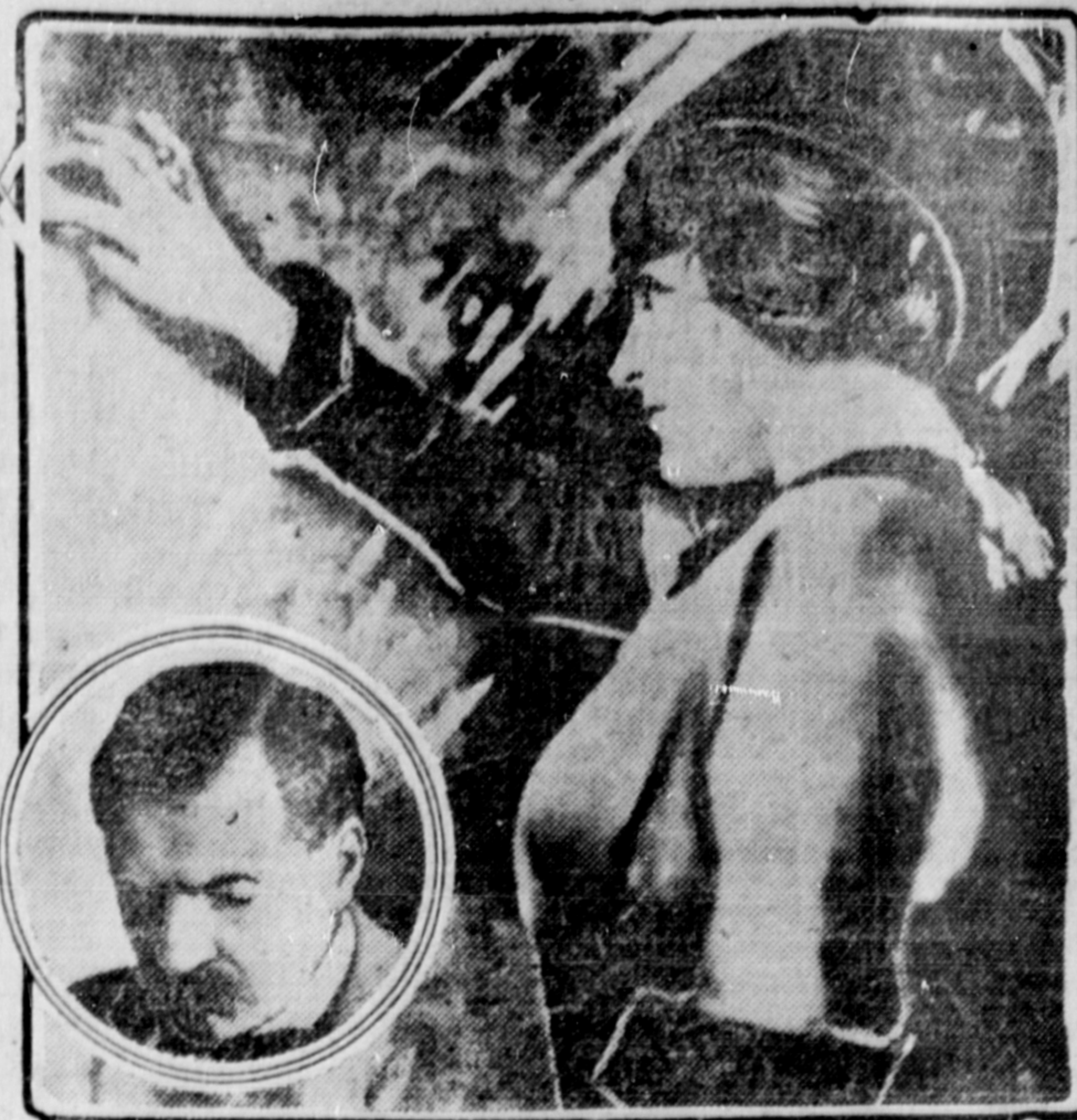
PAUL BOURGET + MME. HENRIETTE CAILLAUX +