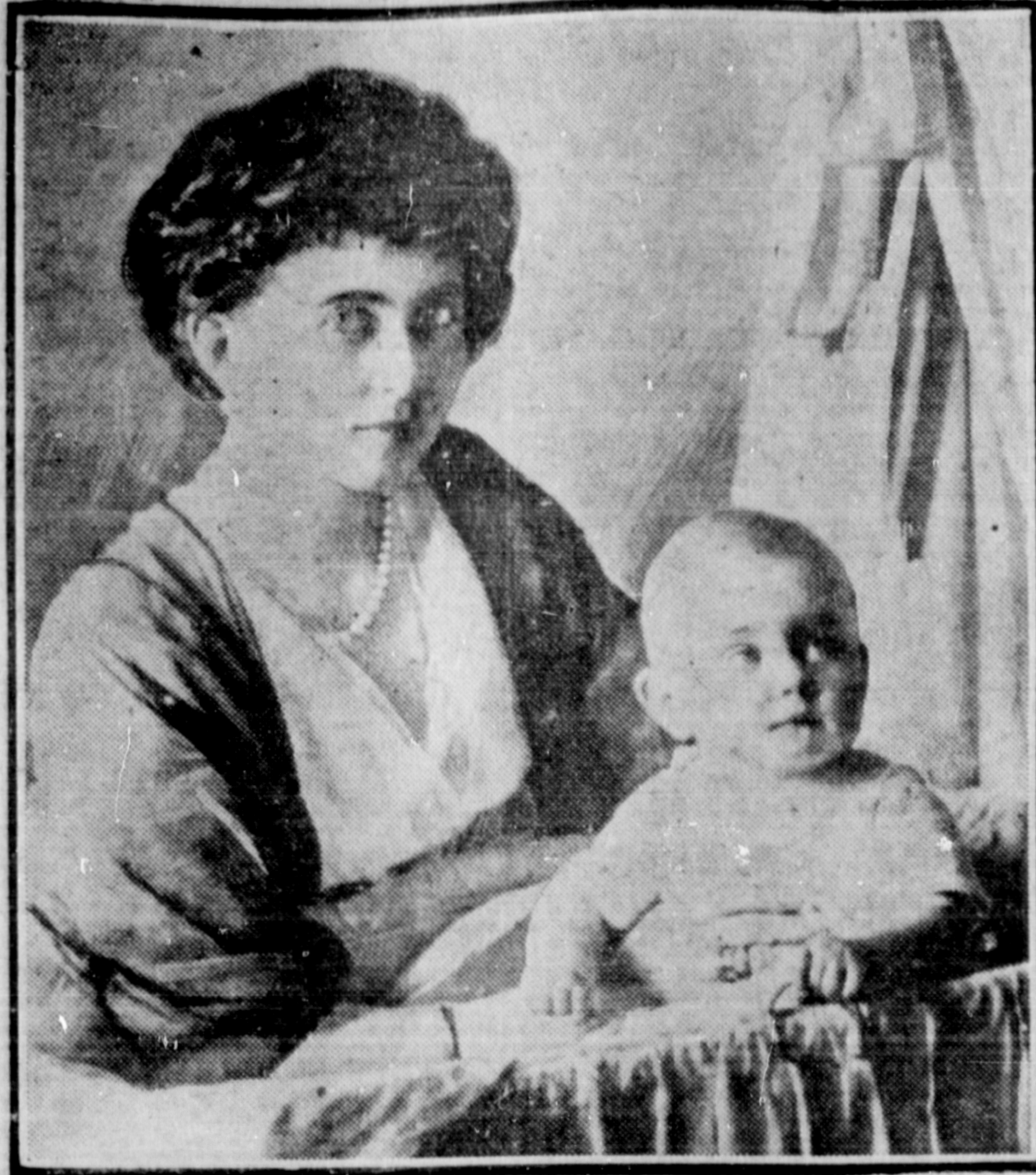
QUEEN OF GREECE WITH LITTLE DAUGHTER

Born while her father was fighting the Turks. The young Princess Katherine of Greece, the sixth child of Queen Sophia, sister of the German Kaiser, was born while her father, the King of Greece, was at the front during the Balkan war. While on the battlefield, he was apprised of the birth of the princess, and vowed that every soldier of the empire would be the godfather to his newly-born daughter. As the fighting strength of the Grecian army at that time was 150,000 men, and as there were on the reserve list another 200,000 men, the charming young princess can boast of being the only living infant who has 350,000 godfathers. The Princess Katherine has two sisters and three brothers. Her mother married the present King Constantine in 1889.