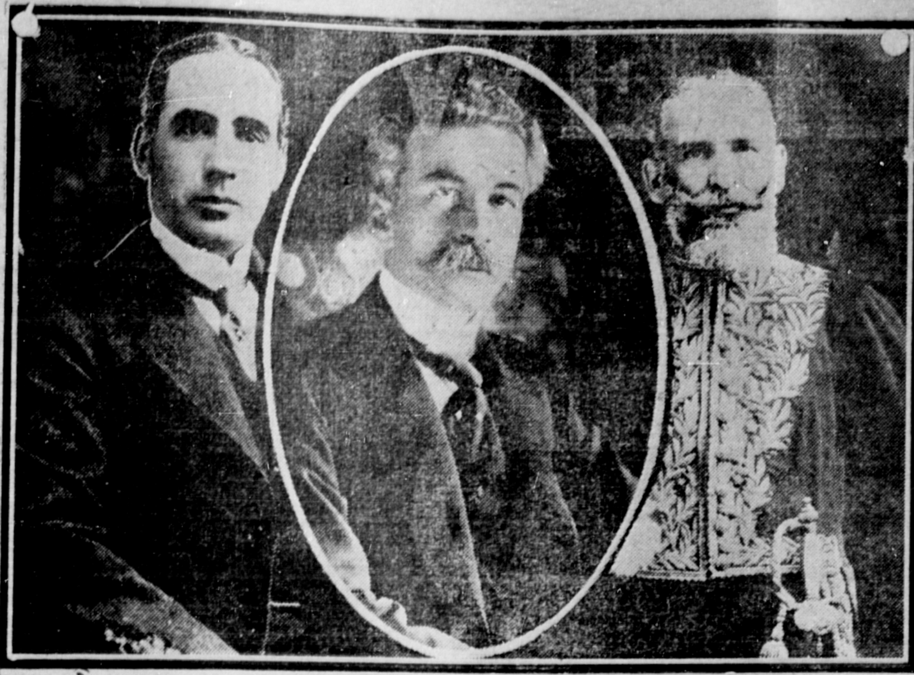
THE THREE ARBITRATORS IN THE CRISIS BETWEEN THE U.S. AND MEXICO

TAKE NOTICE that: (1) The Council of the Corporation of the City of Prince Rupert intends to construct as a Local Improvement a sixteen (16) foot plank roadway on Summit Street from the existing plank roadway on Taylor Street to the west side of Lot 56, Block 14, Section 5. (2) The estimated cost of the work is $2,500.00, of which $5,539.50 is to be paid by the Corporation. The special rate per foot frontage is 3.09381. The special assessment is to be paid in four annual instalments. (3) The estimated lifetime of the work is four years. (4) A Court of Revision will be held on the Fourth day of June, 1914, at 10:30 o'clock a. m., at the City Hall, Fulton Street, for the purpose of hearing complaints against the proposed assessments and the accuracy of frontage measurements and any other complaint which persons interested may desire to make and which is by law cognizable by the Court. Dated this 19th day of May, 1914. ERNEST A. WOODS, City Clerk.