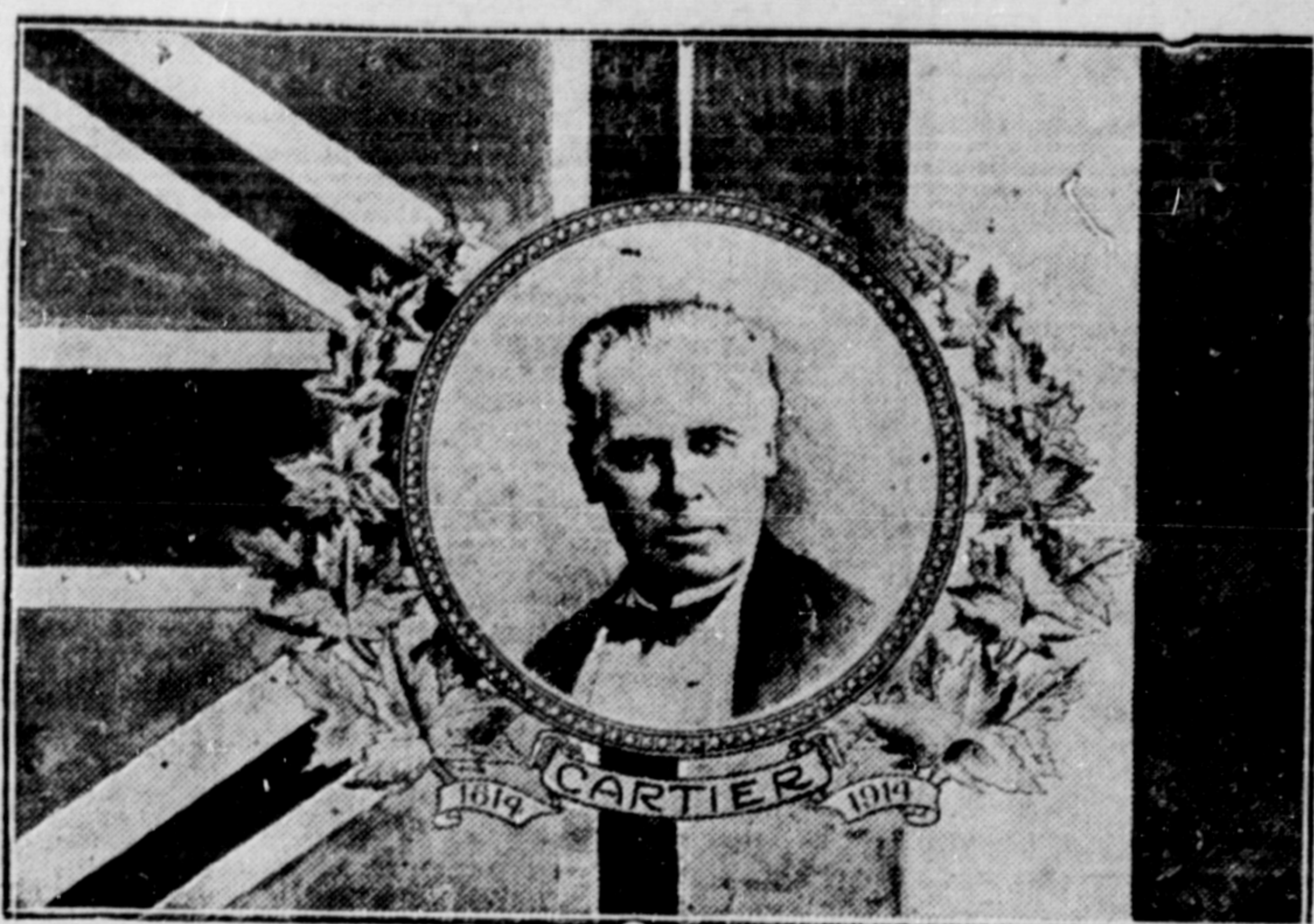
TO CELEBRATE CENTENARY OF SIR ETIENNE CARTIER