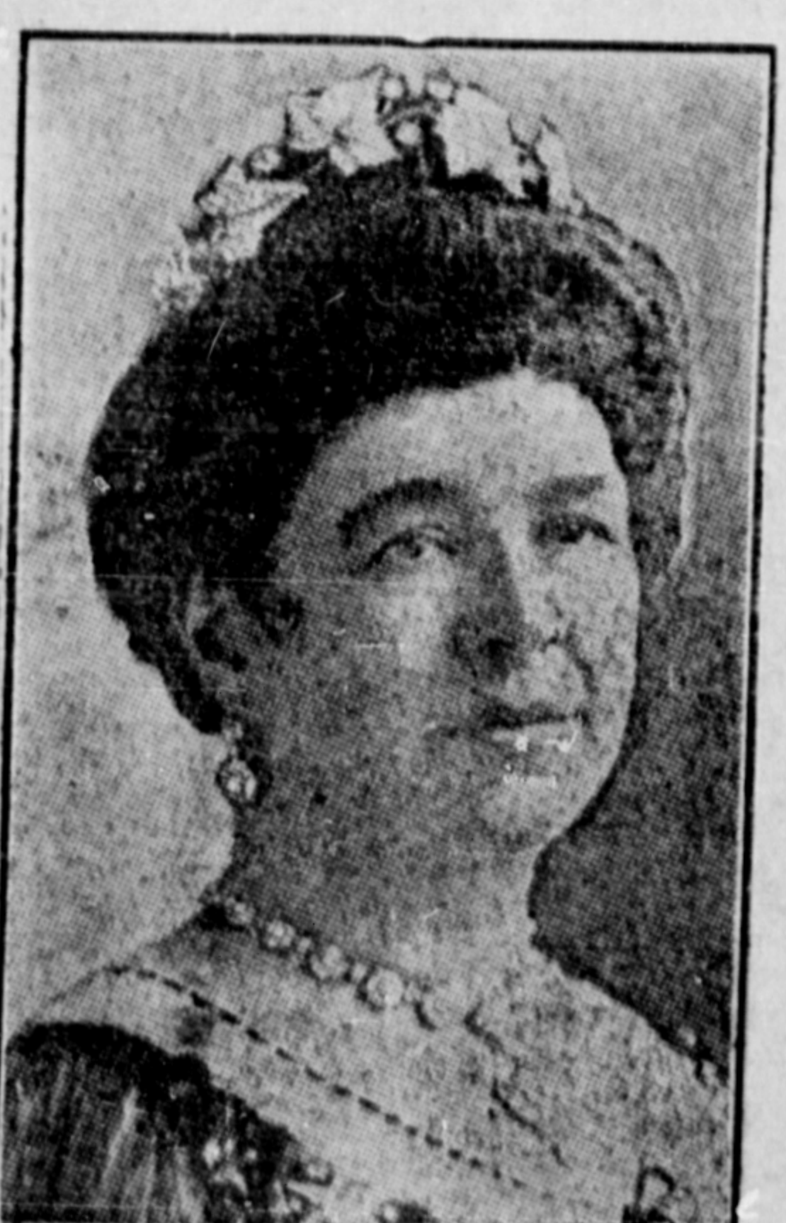
LADY ABERDEEN Who has presided over the International Council of Women for twenty years.

You will soon be able to purchase local shingles, made in Port Edward. 1021f