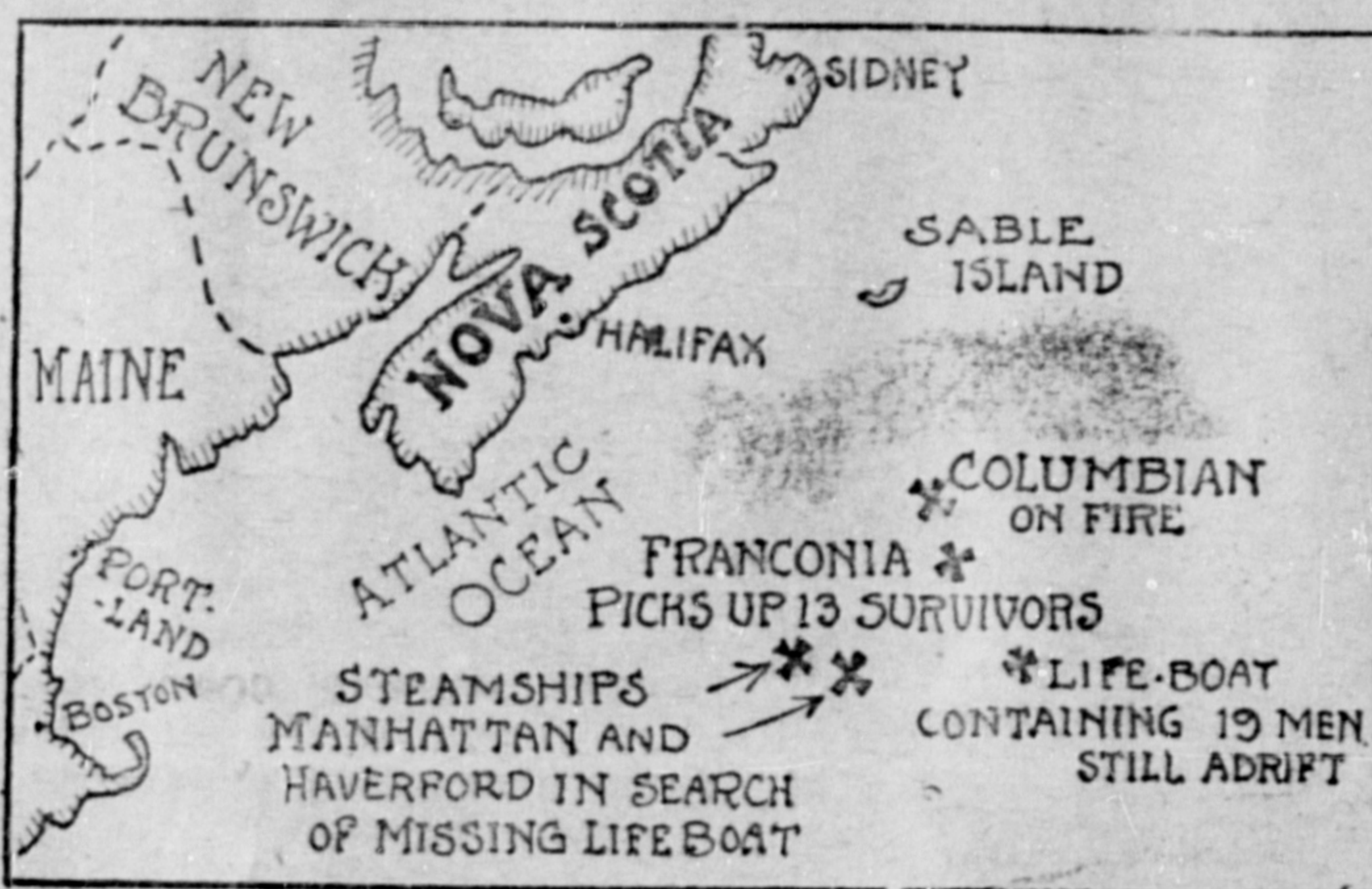
MAP SHOWING SCENE OF DISASTER OF COLUMBIAN

Where the freighter Columbian of the Leyland Line took fire, and where thirteen of the crew were picked up by the Franconia.