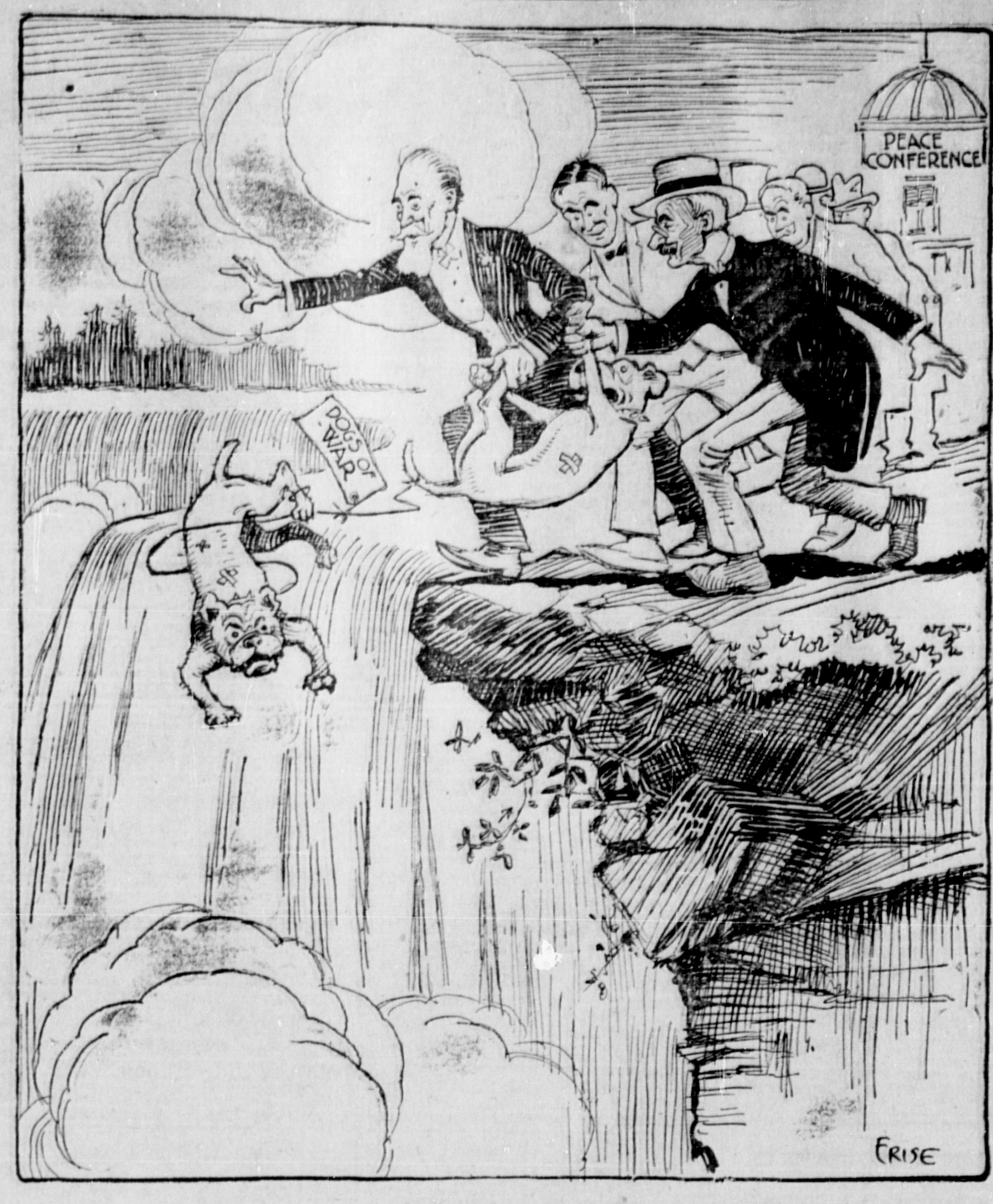
Disposing of the Dogs of War