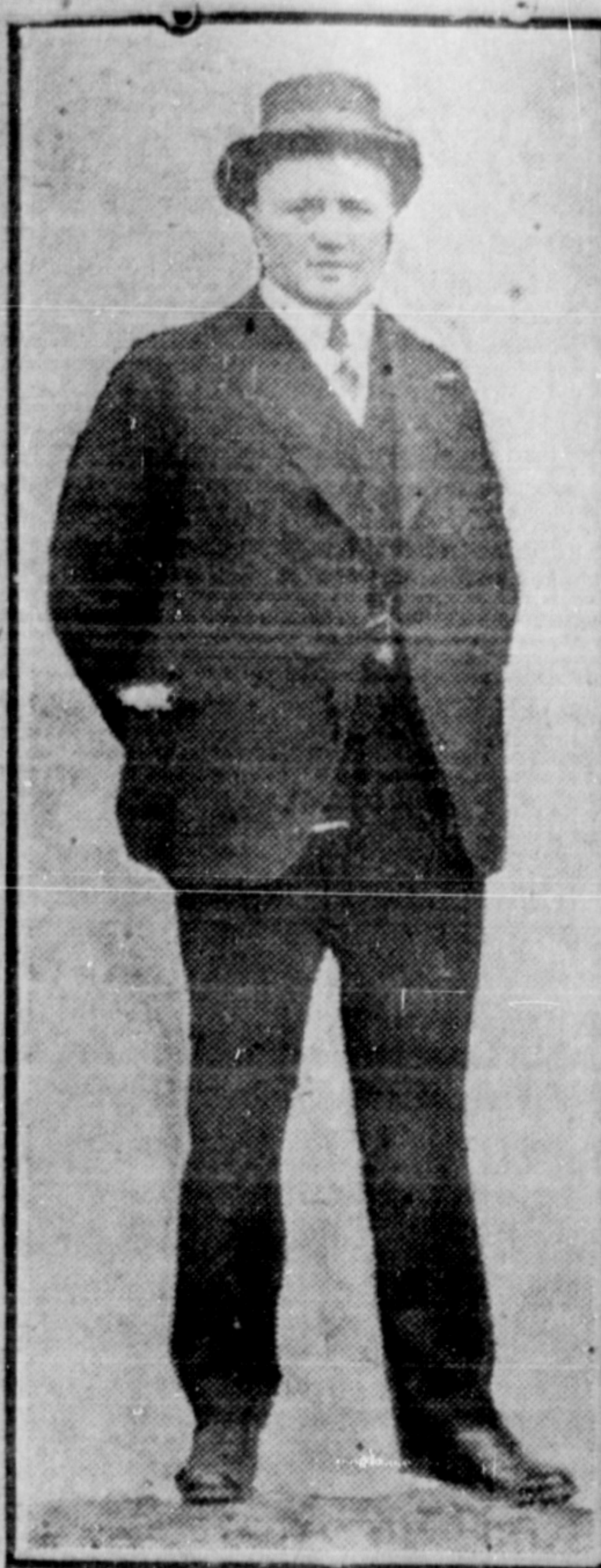
TRAINER OF KING'S PLATE WINNER

While you wait shoe repairing, F. German's, opposite postoffice, mws