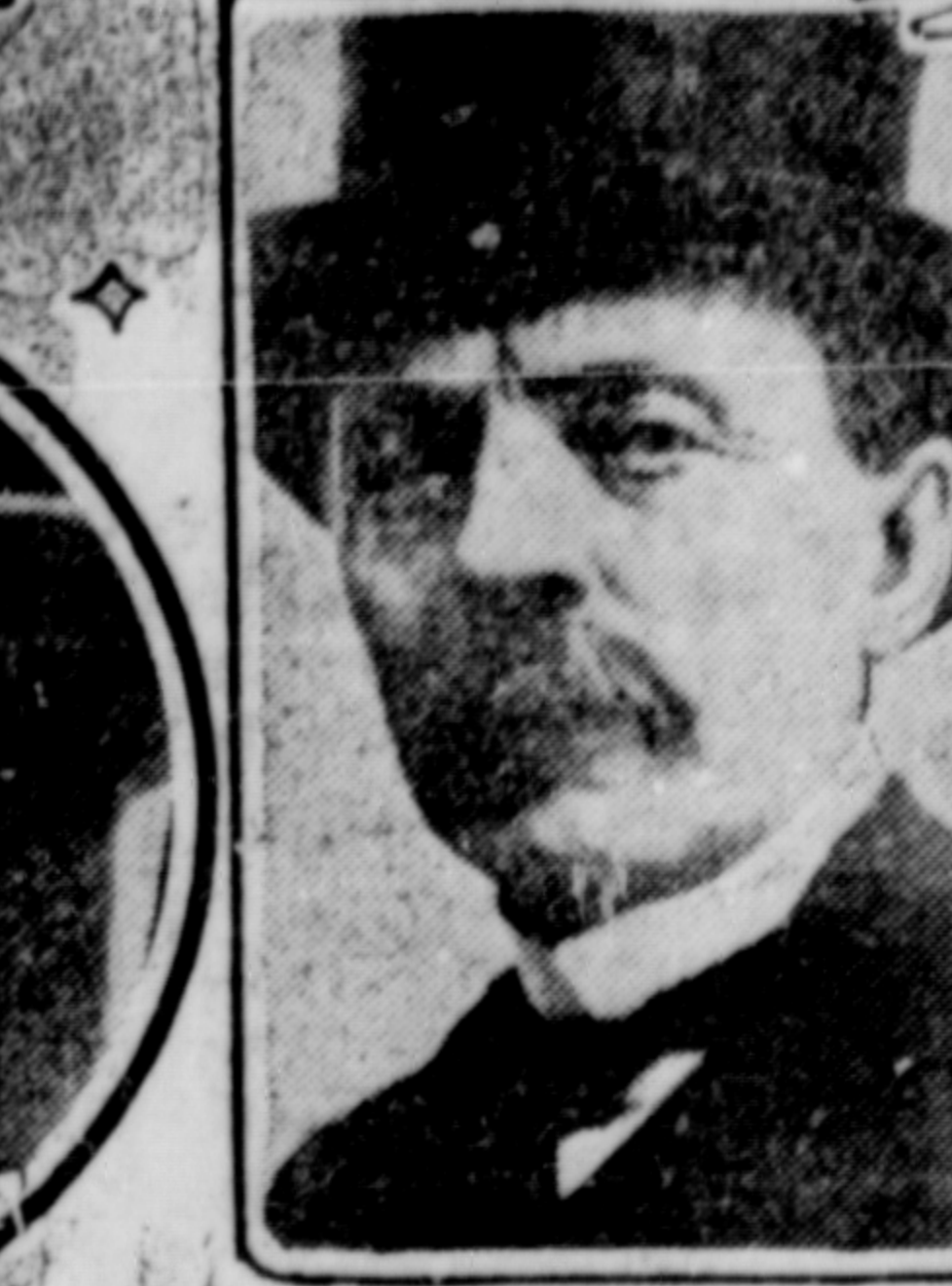
E.L. NEWCOMBE, DEPUTY MIN. OF JUSTICE REPRESENTING CANADIAN GOVT.