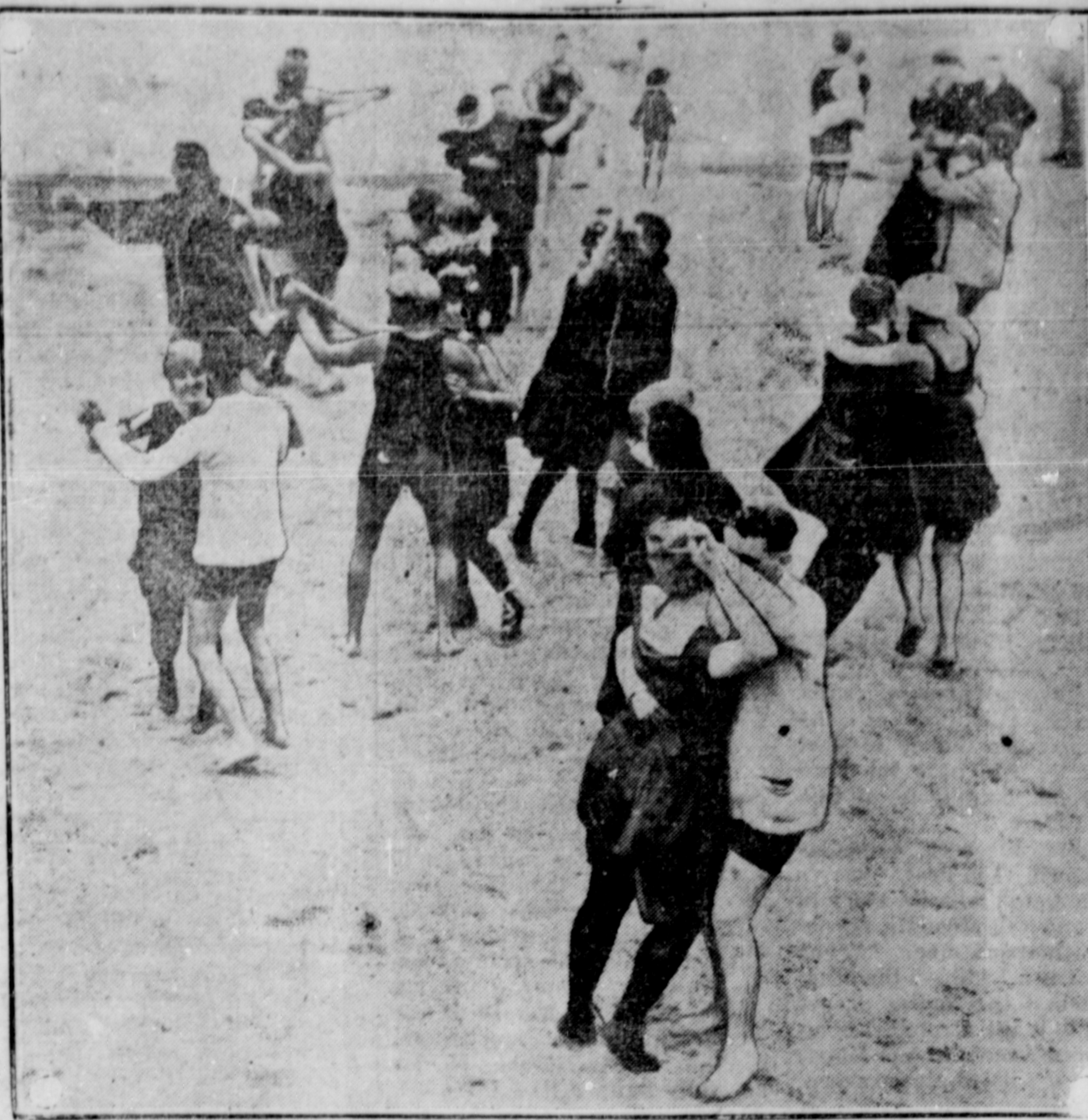
TANGO AND HESITATION ON BRIGHTON BEACH, ENGLAND

Even the hot summer weather has not forced the discontinuance of the popular dances which took England by storm during the winter season. Tangoing on the beach promises to be the popular pastime this summer, and it is likely that this form of amusement will extend to this country and the States before long.