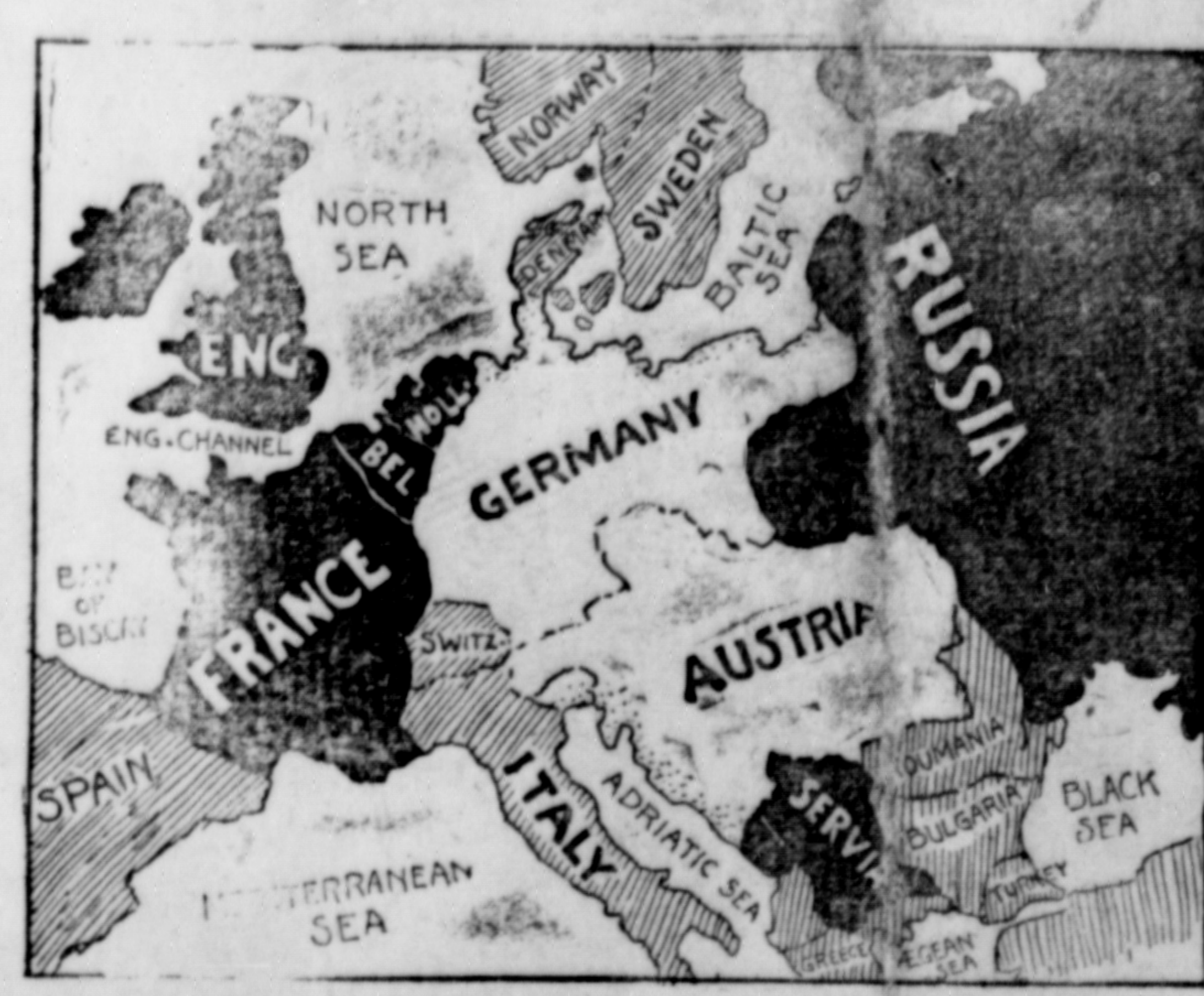
HOW EUROPE LINES UP

The German allies are shown in white, the British in black and those declaring neutrality are shaded.