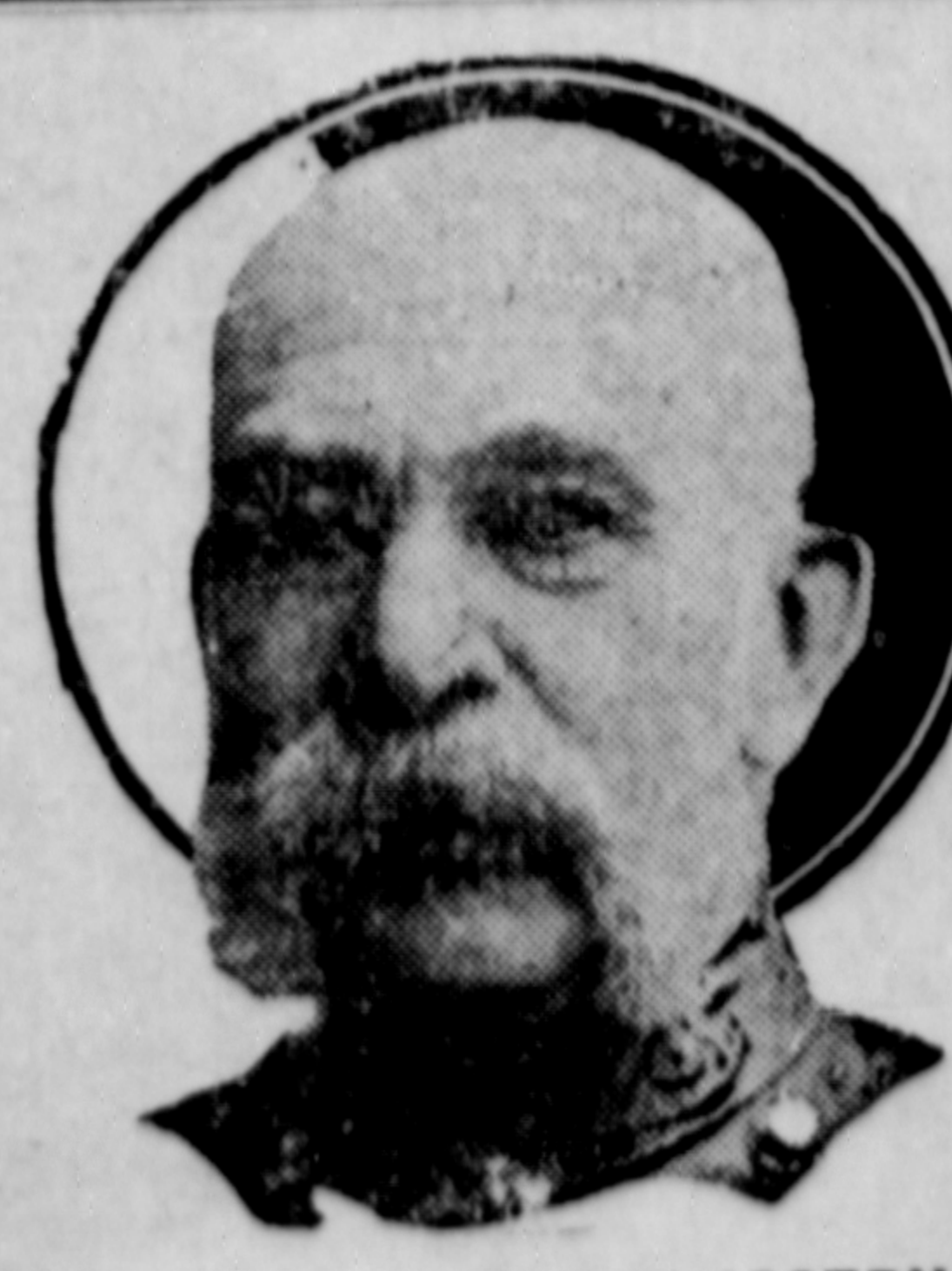
EMPEROR FRANCES JOSEPH Who is Reported Dying in a despatch from Rome