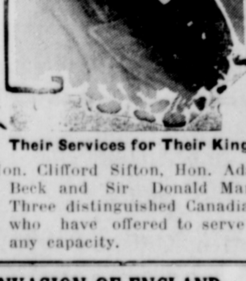
Their Services for Their King

Hon. Clifford Sifton, Hon. Adam Beck and Sir Donald Mann, Three distinguished Canadians who have offered to serve in any capacity.