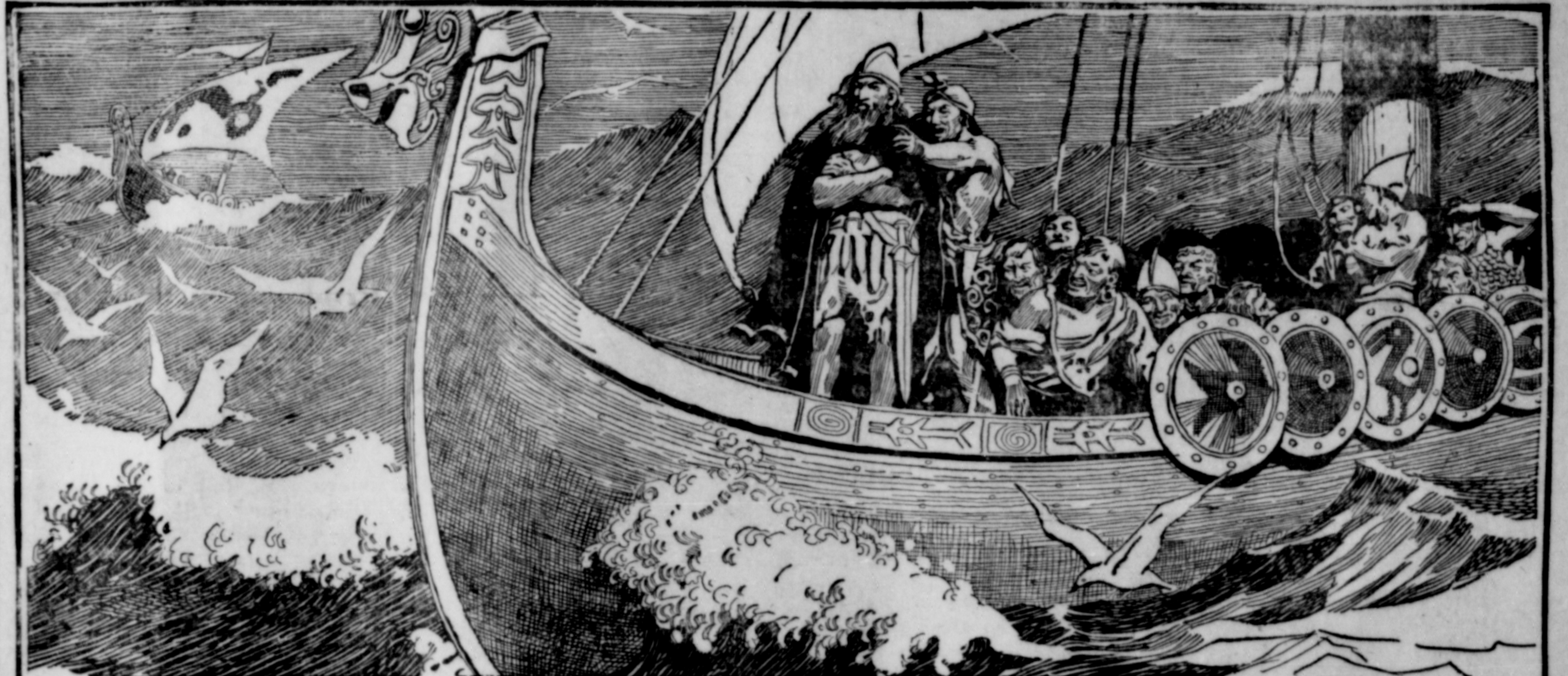
"NATIONAL HERO SERIES" NO. 5