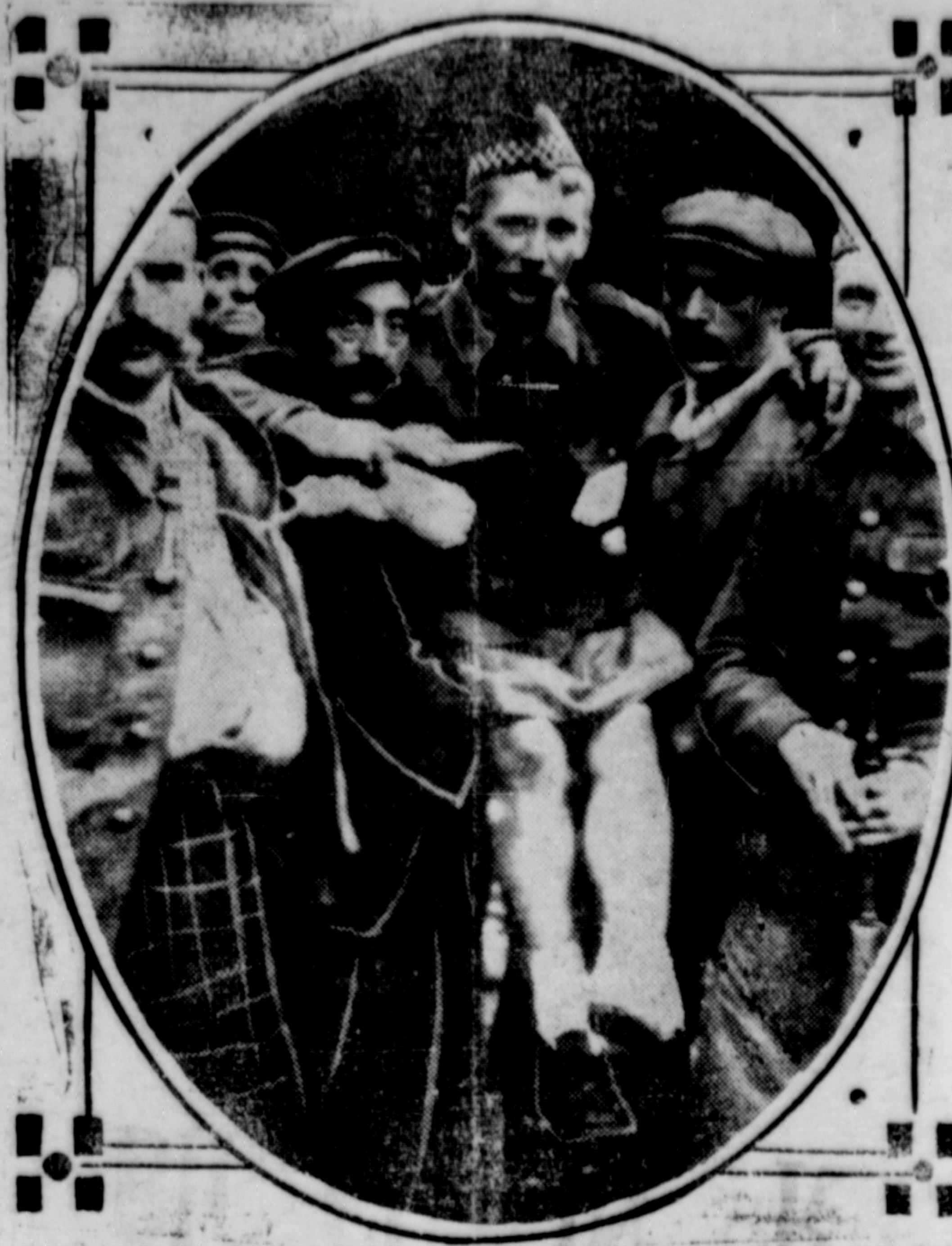
A WOUNDED SOLDIER COMING HOME. Wounded Highlander being carried ashore from the Channel boat at Folkstone.