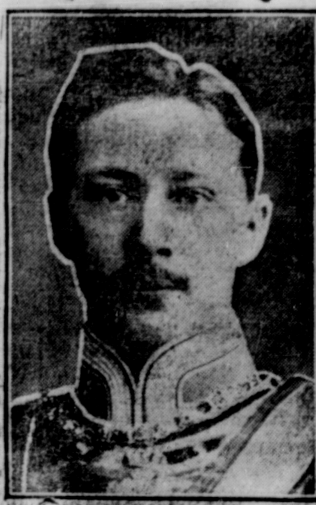
Crown Prince Frederick William. In command of the Imperial Guards, said to have been annihilated.

Doors Open at 10 P. M.—Commence at 10:30 P. M. Sharp Main Bout at 11:15 Ringside Reserved $3—General Admission $2 General Admission Tickets Bought Today $1.50 TICKETS ON SALE AT ALL CIGAR STORES