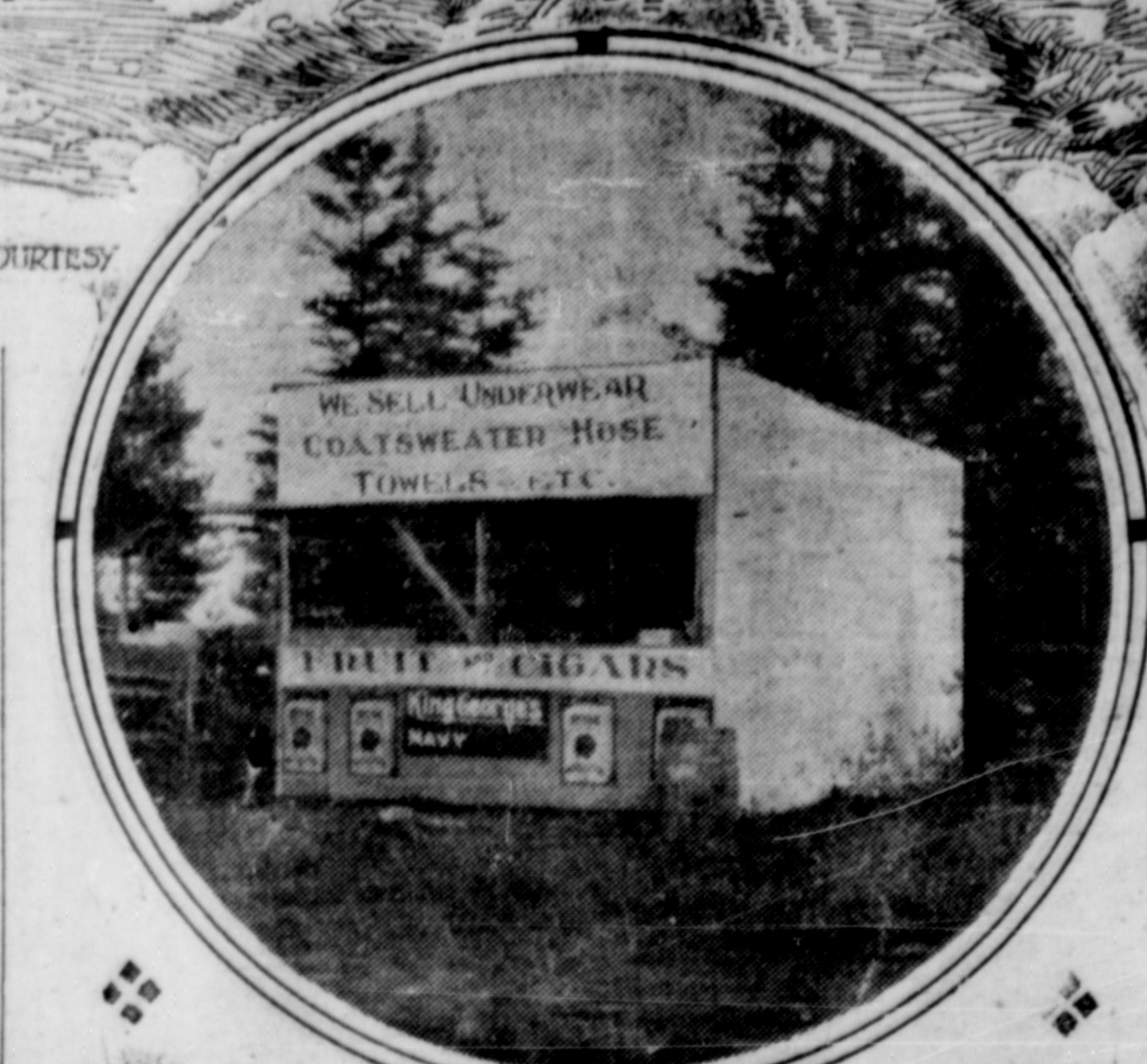
ONE OF THE MANY CANTEENS COURTESY OF C.N.R.

NO DUST THE E. F. DALLEY CO. LIMITED HAMILTON, CAN. BUFFALO, N.Y. NO RUST