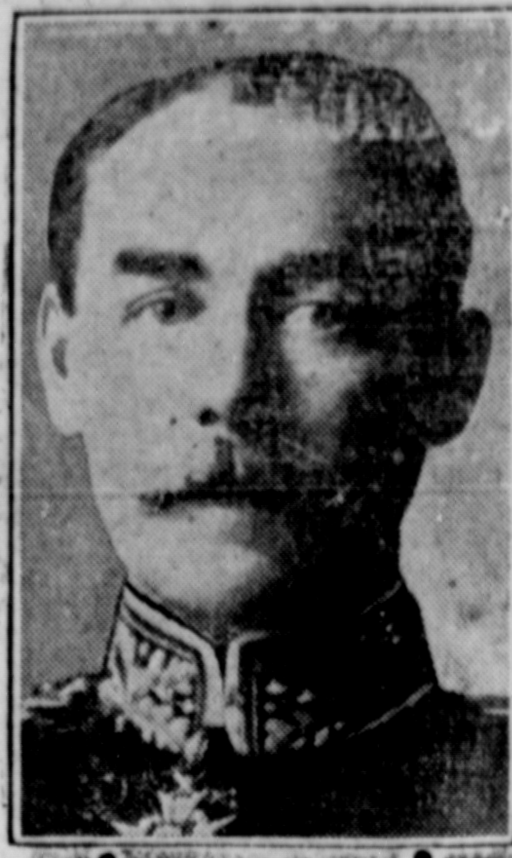
SIR A. J. MURRAY

Chief of staff of Sir John French. He served both in Zululand and in South Africa.