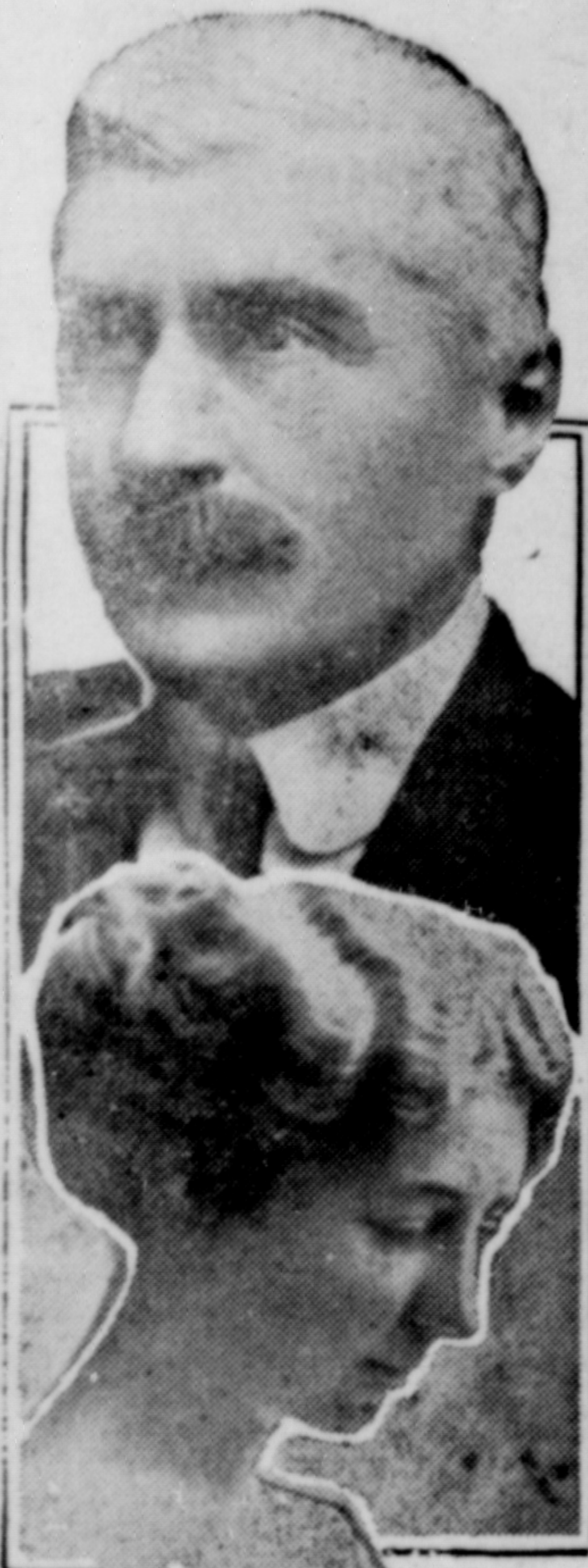
SIR HAMILTON AND LADY GOULD-ADAMS

Ladies' Furs, Muffs and Stoles; medium prices. Wallace's. 1f