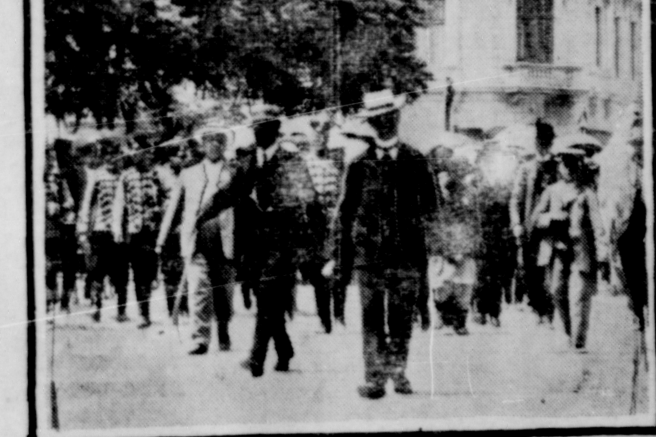
BELGRADE EVACUATED BY THE SERVIANS — Pictures of Belgrade, which has recently been reported to be evacuated by the Servian army and telegraphic communication cut between it and Nish, the present location of the capital.